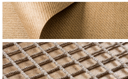
to Bcomp's reinforcement fabrics