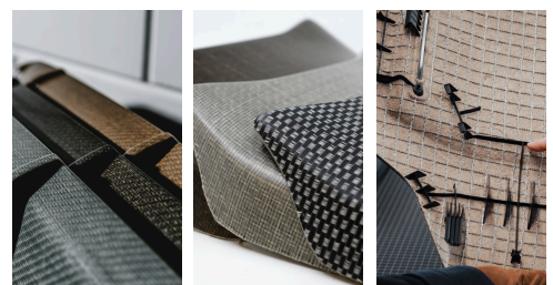
to natural fibre parts