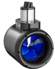
(2x) POD 3.0