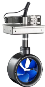
Steerable POD 11.0