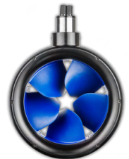
(2x) POD 11.0