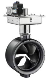
(2x) Steerable POD 50.0