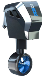
(2x) Steerable outboard 15.0