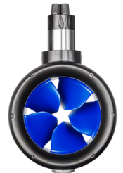
Stern thruster 5.0