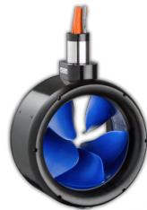
(2x) POD-S 11.0