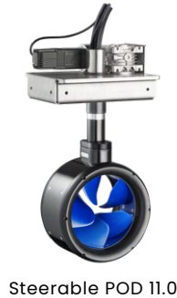
Steerable POD 11.0