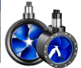
(2x) POD 15.0 Standard bow thruster 5.0