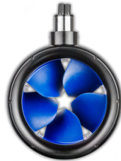
(2x) POD 15.0