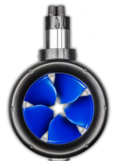
(2x) POD 5.0