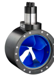
Standard bow thruster 4.2