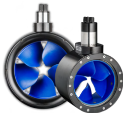
(2x) POD 11.0 Standard bow thruster 5.0