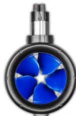
(2x) POD 5.0