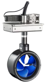
Steerable POD 11.0