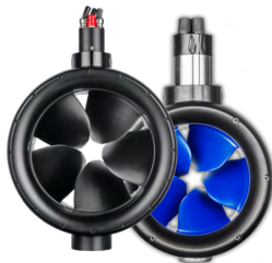
(2x) POD 25.0 (2x) POD 5.0