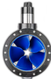
(1x) bow thruster 11.0