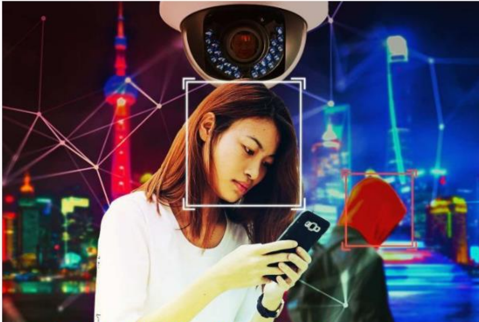
PHOTO: China's Social Credit System has been described as 'Orwellian' — but is it really? (ABC News: GFX/Jarrod Fankhauser)