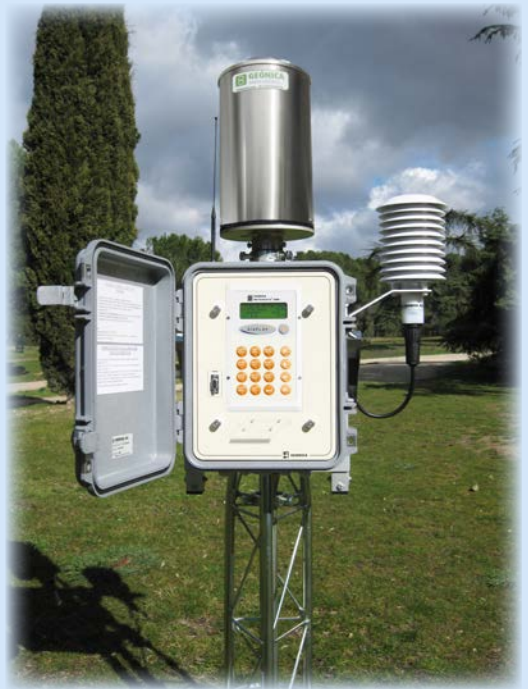
RAINALERT / HYDROMET Station with METEODATA Unit

Therefore, from the moment the event begins to occur, the RAINALERT System is already operational and able to start generating alerts in the form of pre-alerts and alerts of different risk levels. Hence its effectiveness in working with data and trends updated continuously and not with information from predictions that lack sufficient spatial and temporal resolution to determine the imminence of certain risk in a very specific area.