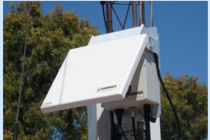
INMARSAT BGAN Satellite Transceiver

Additionally the remote station is also equipped with a second bidirectional communications channel, the INMARSAT BGAN (Broadband Global Area Network) Satellite, essential in cases in which the GPRS / 3G / 4G cellular coverage does not exist or is deficient. Both communication channels can be used alternatively or redundantly.