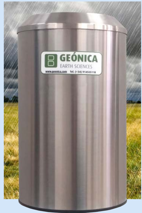
DATARAIN-4000 Electronic Weighing Precipitation Sensor

The description and technical features of each of these elements are available in the corresponding specific brochures.