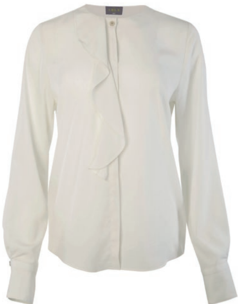
Chantelle Blouse • Ivory • S-XL • £55