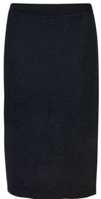
Florence Wrap Skirt • Charcoal • S-XL • £55