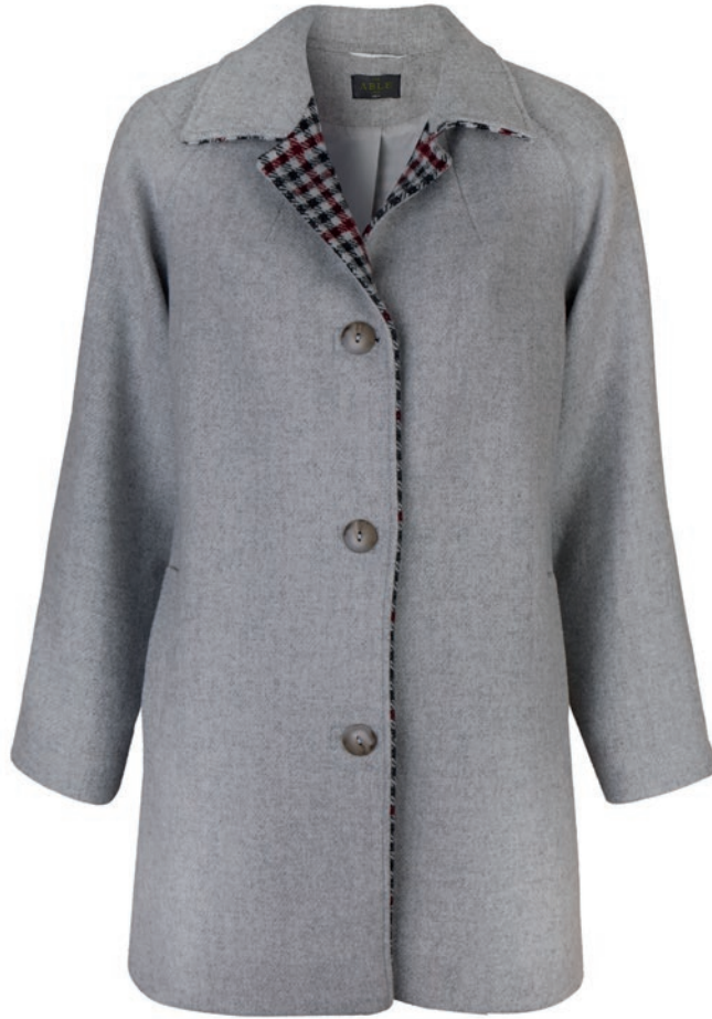
Marilyn Wool Blend Coat • Light Grey • S-XL • £130