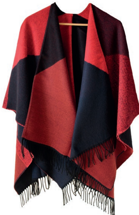
Paloma Luxury Wrap • Dragon Red • O/S • £59