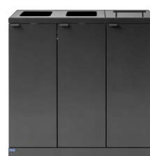
Bica Model 873 Waste sorting 3x65 ltr.