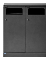
Bica Model 712 Waste sorting 2x100 ltr.