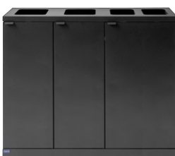
Bica Model 950 Waste sorting 2x65 + 2x45 ltr.