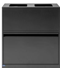
Bica Model 880 Waste sorting 80 ltr. Up to 11 fractions

Bica waste sorting is a durable solution created for everyday use. Developed for the large office, the classroom, theater or shopping centre. Waste sorting must be easy to use. Bica inner bins allow further division of waste. Our waste solutions are available in black and anthracite as standard with smooth surfaces for easy cleaning.