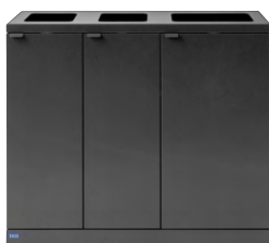
Bica Model 829 Waste sorting 2x65 + 1x95 ltr.

Optimize your business with an effective solution for indoor waste sorting. With Bica recycling bins, waste sorting becomes easier in the office, educational institution, school, airport and at the theatre. Our waste sorting solutions for indoor use are stylish, so they can easily fit into the interior and can be combined as needed.