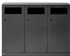
Bica Model 713 Waste sorting 3x100 ltr.

Makes it easy to sort waste in all outdoor areas. Both in parks, in urban spaces, shopping streets and in outdoor areas at the company. With a Bica outdoor recycling bin, the best conditions for sorting are created. The outdoor waste bins are designed in a strong construction with and without an ashtray.