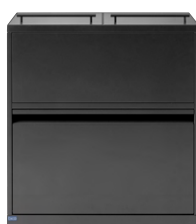
Bica Model 881 Waste sorting 80 ltr. Up to 11 fractions