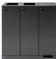
Bica Model 973 Waste sorting 3x65 ltr.