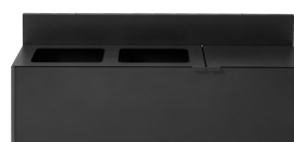
Bica Model 911 Waste sorting 3x20 ltr.