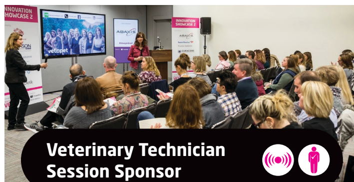
Veterinary Technician Session Sponsor