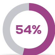
eCommerce job functions