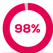
Membership activity engagement