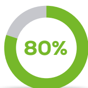
Senior contacts and budget holders