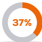
Marketing and Digital job functions