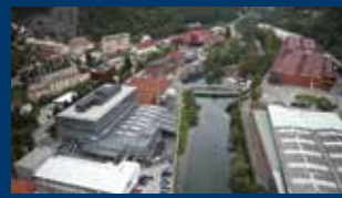
Idrija (SI) ■ ■ ■