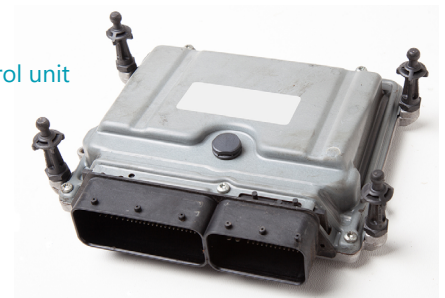
Electronic control unit

These products must meet a wide range of requirements. This includes being sealed against dirt and moisture. The ingress of liquids can lead to serious malfunctions and consequential damage. For this reason, leak testing - conducted as a 100% routine test as part of the end-of-line testing in the production process - is of particular importance.