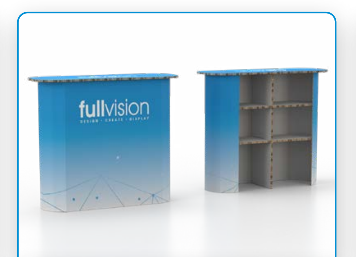
Sustainable desk Size: 1200x1000x300 mm | £280.00 per desk

Sustainable high table Size: 500x940x500mm | £280.00 per table