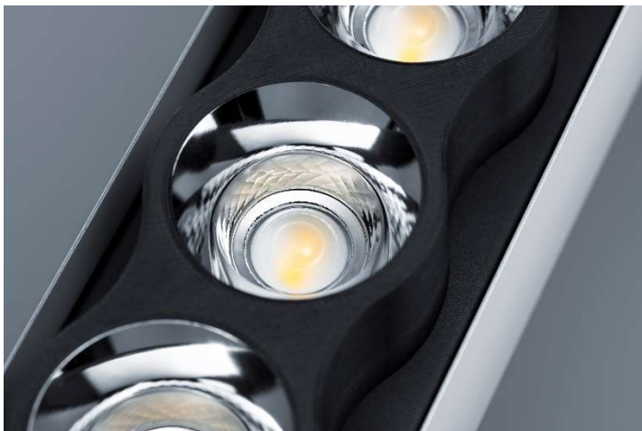
Image 2: Designed in line with Zumtobel Circular Design Rules (CDR), IZURA meets the requirements of a circular economy. Features include a plastic-free reflector made of biodegradable biocomposites and a housing crafted from recyclable steel.

Image 1: The IZURA concept luminaire focuses on customizable design, allowing users to adapt the housing with any desired color and surface texture. Whether specific Pantone shades, intricate patterns, personalized text, or photos, the pendant luminaire can be tailored to meet diverse user preferences.