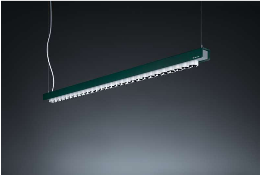
Image 3: The concept incorporates a modular product design with only 40 components, eliminating the need for welding. This allows for easy replacement of the housing without requiring extensive part exchanges, saving resources and enhancing sustainability.