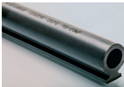
Marking of rubber profiles