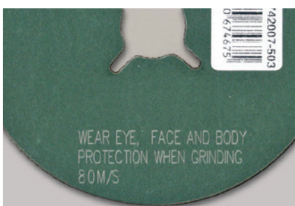
Writing on sanding discs