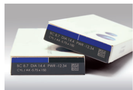
Coding and marking of packaging through color removal