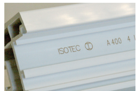
Marking of plastics