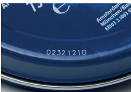
Writing on painted tins

The REA JET TITAN Platform. The single operating concept for all REA JET technologies.