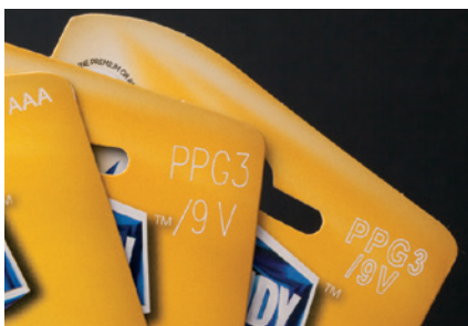
Writing on card