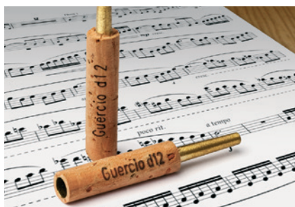
Writing on cork