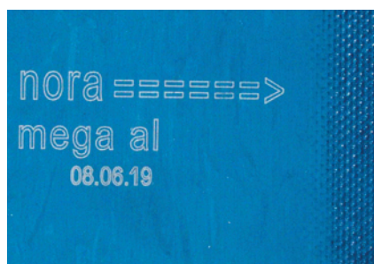
Marking of composite materials