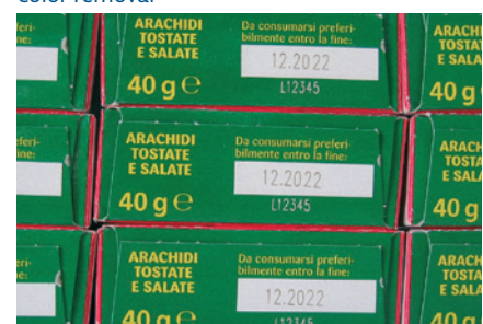
Writing on cardboard boxes