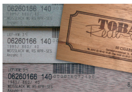
Marking of wooden profiles