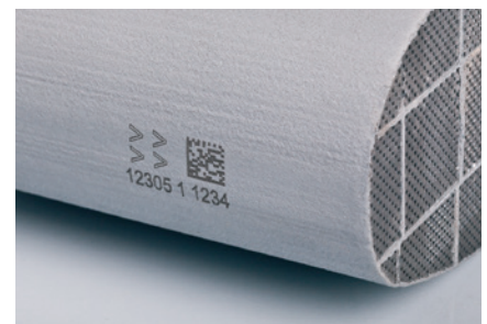
2D Code marking of soot particle filters