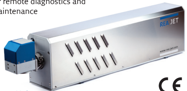
CL Laser Unit