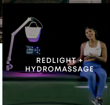
REDLIGHT + HYDROMASSAGE