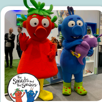
The Smids and the Smids © 2019 & TM Julia Donaldson/Axel Scheffler. Licensed by Magic Light Pictures Ltd.