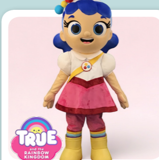
TRUE FRIENDS RAINBOW KINGDOM © 2023 GURU STUDIO