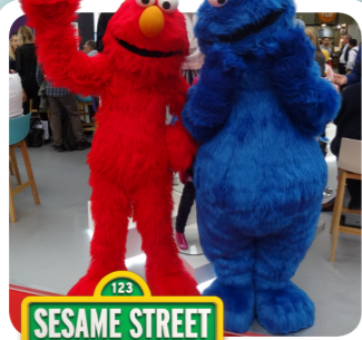
123 SESAME STREET TM and © 2023 Sesame Workshop. All rights reserved.