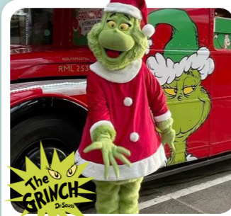
The GRINCH TM & © 2023 Dr. Seuss