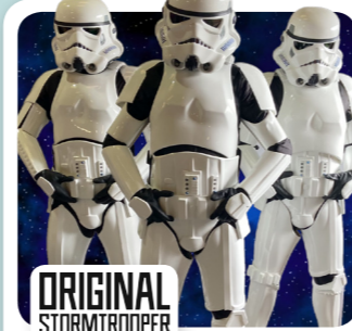
ORIGINAL STORMTROOPER © 2023 Shepperton Design Studios www.originalstormtrooper.com