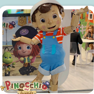
PINOCCHIO Friends Pinocchio and Friends™ © 2021 Rainbow S.p.A. All Rights Reserved. Series created by Iginio Straffi