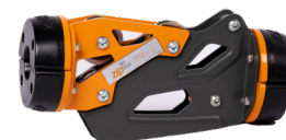
DOUBLE SIDED zipSTOP BRAKE TROLLEY