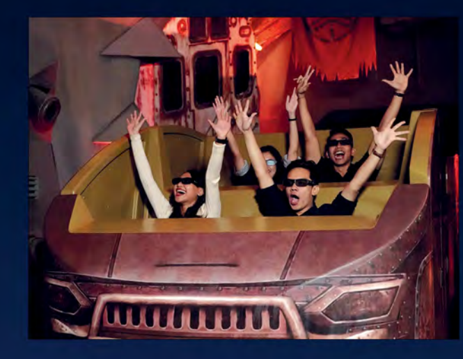
LOCATION: Trans Studio Bali, Indonesia OPENED: 2019 SIZE: 5,000 Square Meters CLIENT: CT Corp