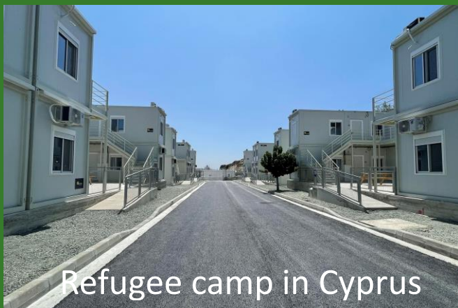
Refugee camp in Cyprus