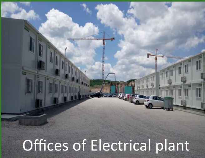
Offices of Electrical plant