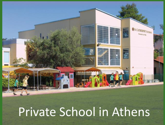
Private School in Athens