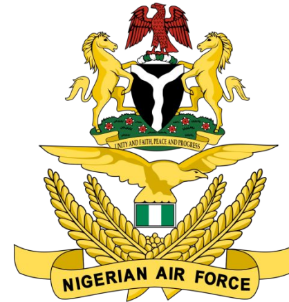
NIGERIAN AIR FORCE