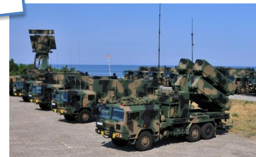
Coastal Missile Squadrons Naval Strike Missile