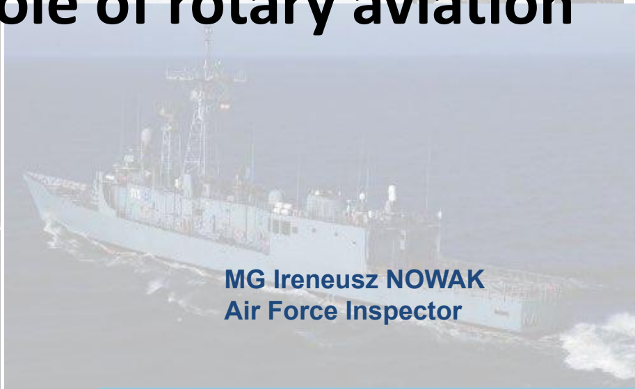
MG Ireneusz NOWAK Air Force Inspector