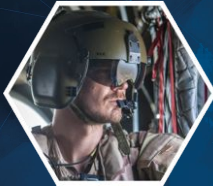
Creating the right Mindset