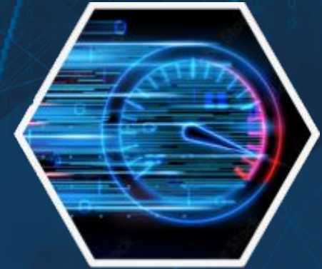
Speed of movement