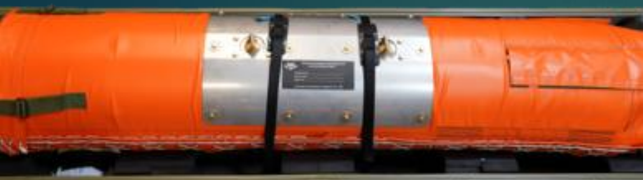
UNI-PAC III System