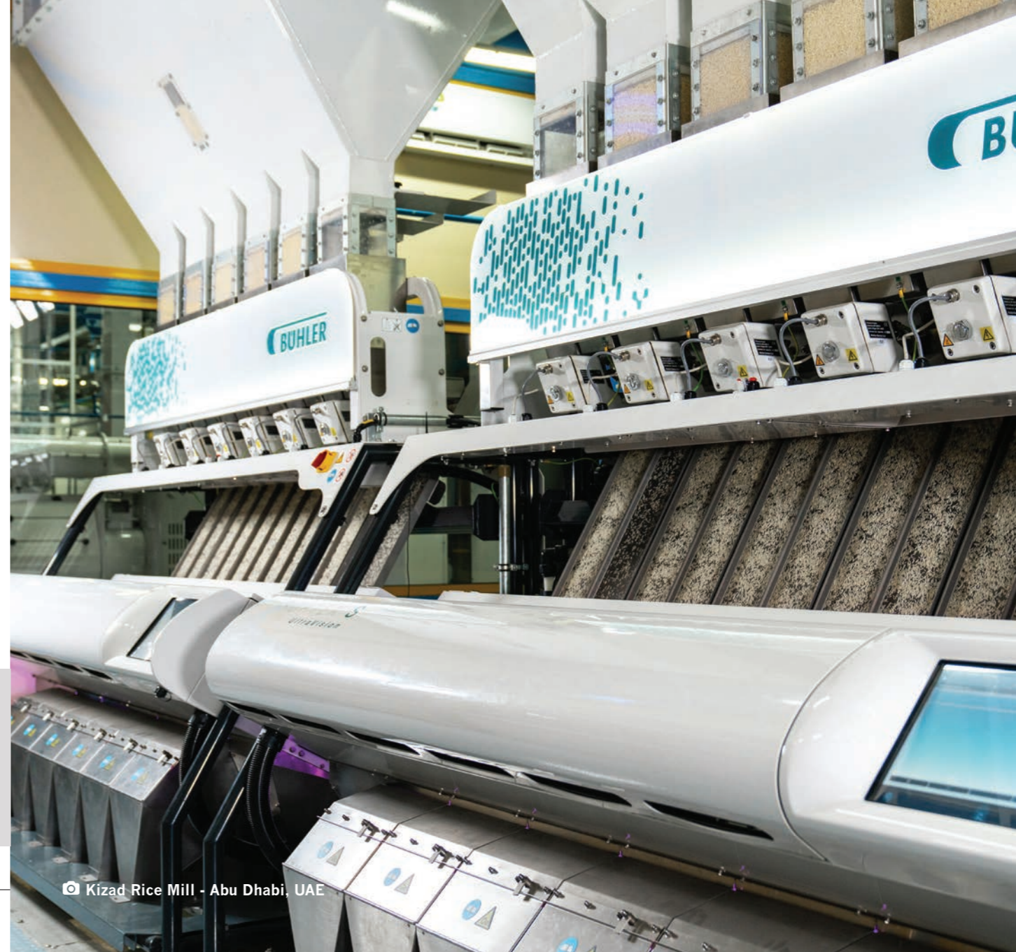
© Kizad Rice Mill - Abu Dhabi, UAE