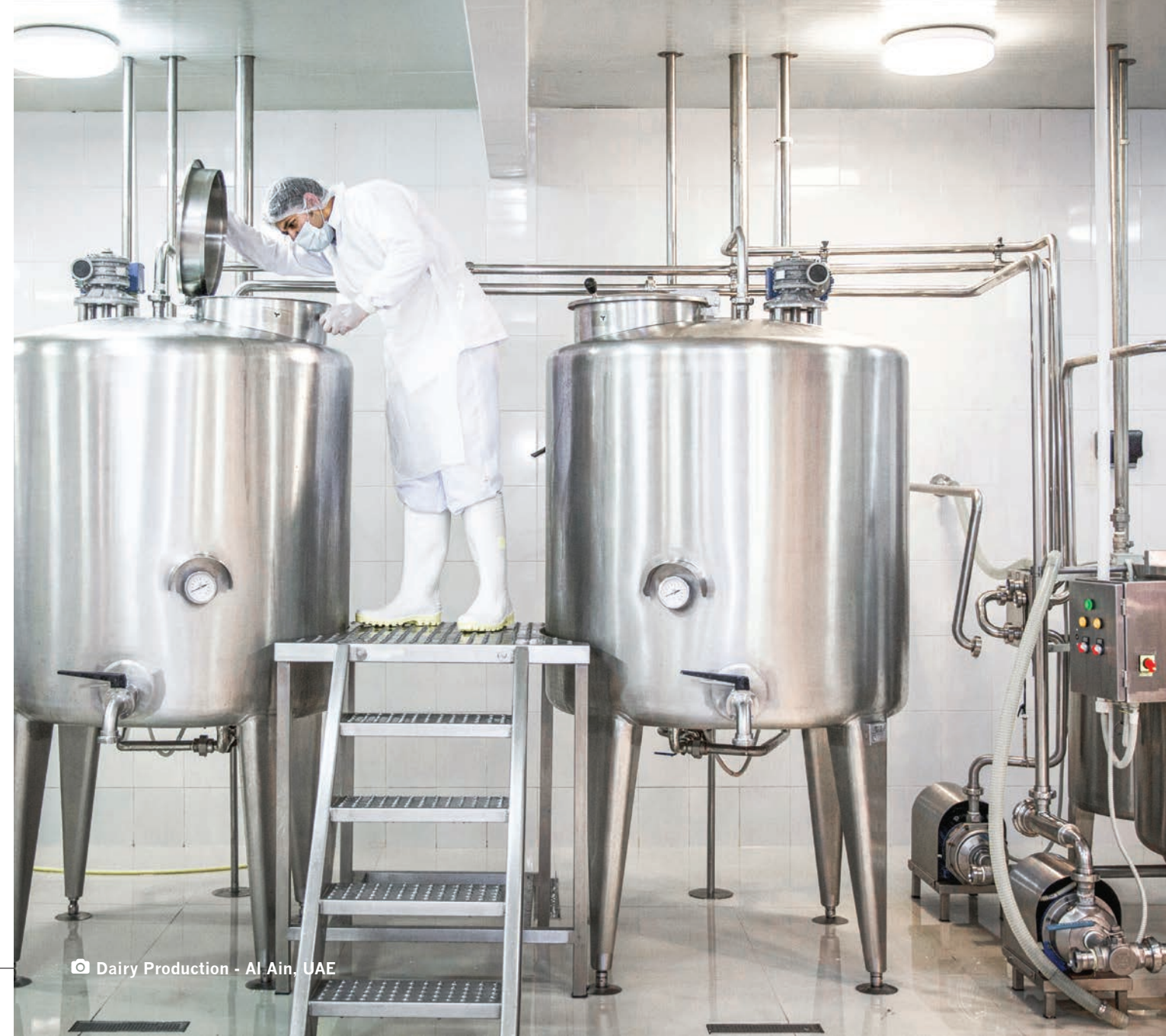
© Dairy Production - Al Ain, UAE