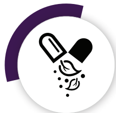
Additives and Supplements