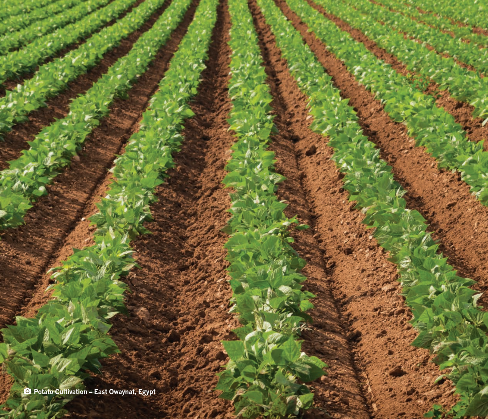
© Potato Cultivation – East Owaynat, Egypt