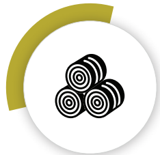
Forage, Roughage, Grasses