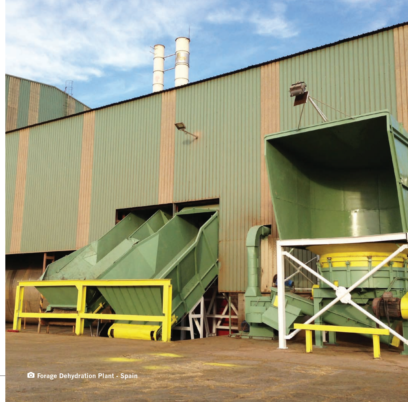
📷 Forage Dehydration Plant - Spain