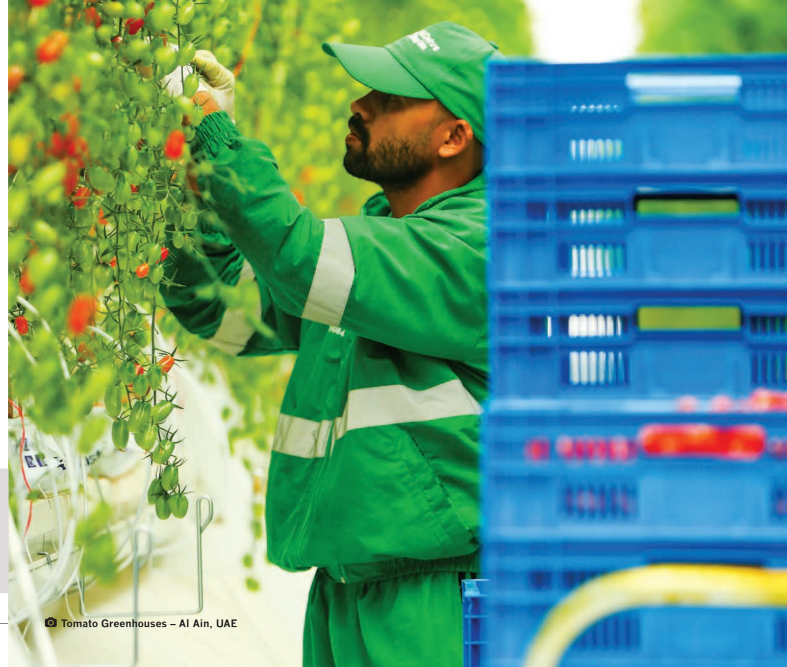
📍 Tomato Greenhouses – Al Ain, UAE