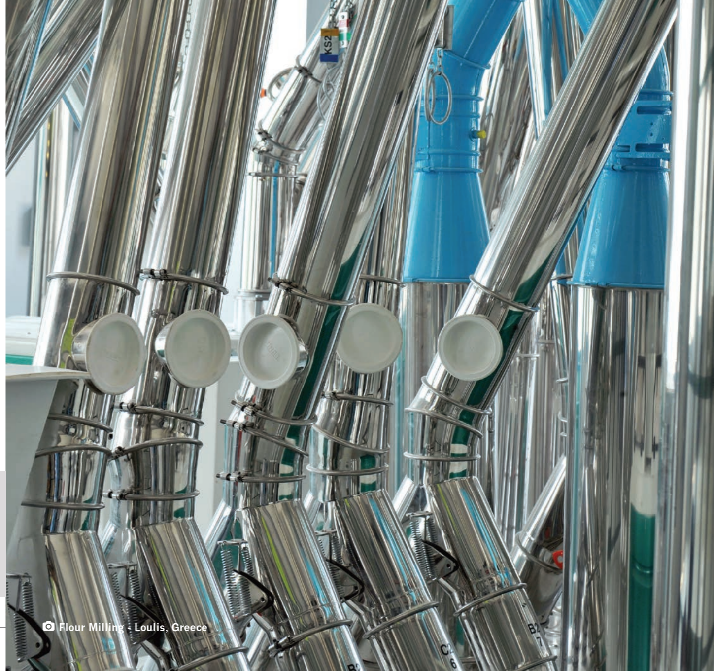
Flour Milling - Loulis, Greece