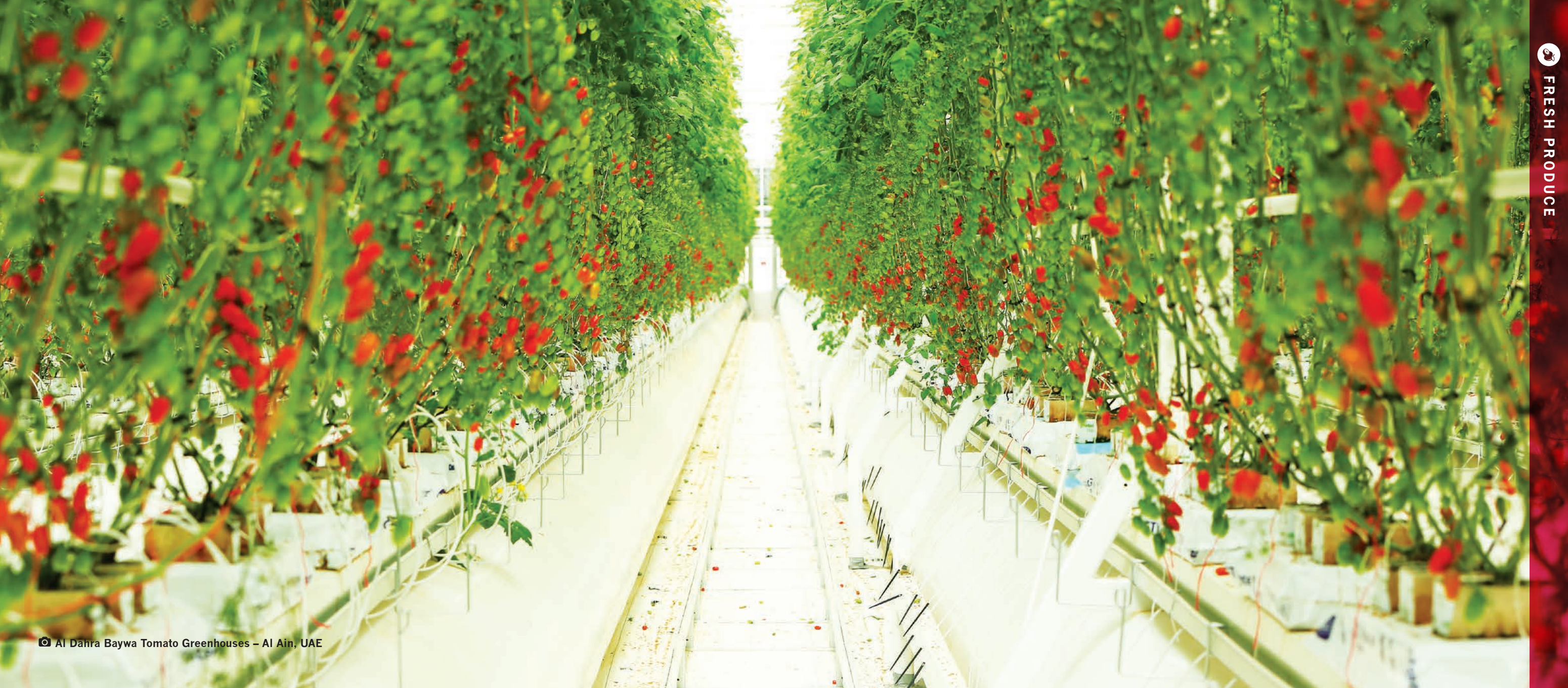
© Al Danra Baywa Tomato Greenhouses – Al Ain, UAE