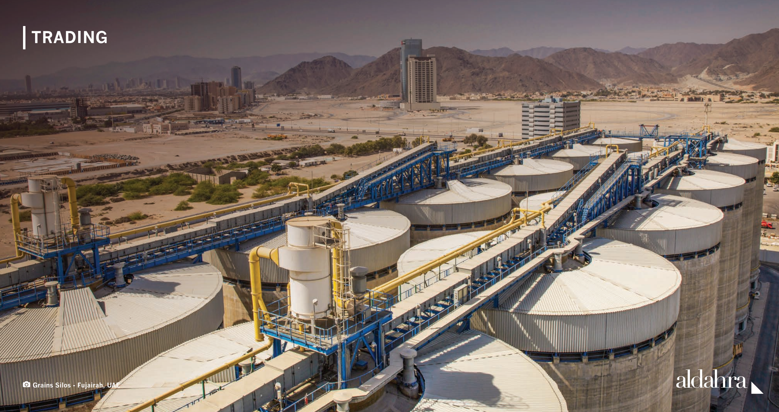
📷 Grains Silos - Fujairah, UAE