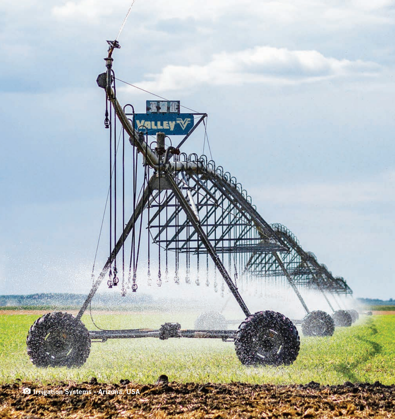
© Irrigation Systems - Arizona, USA