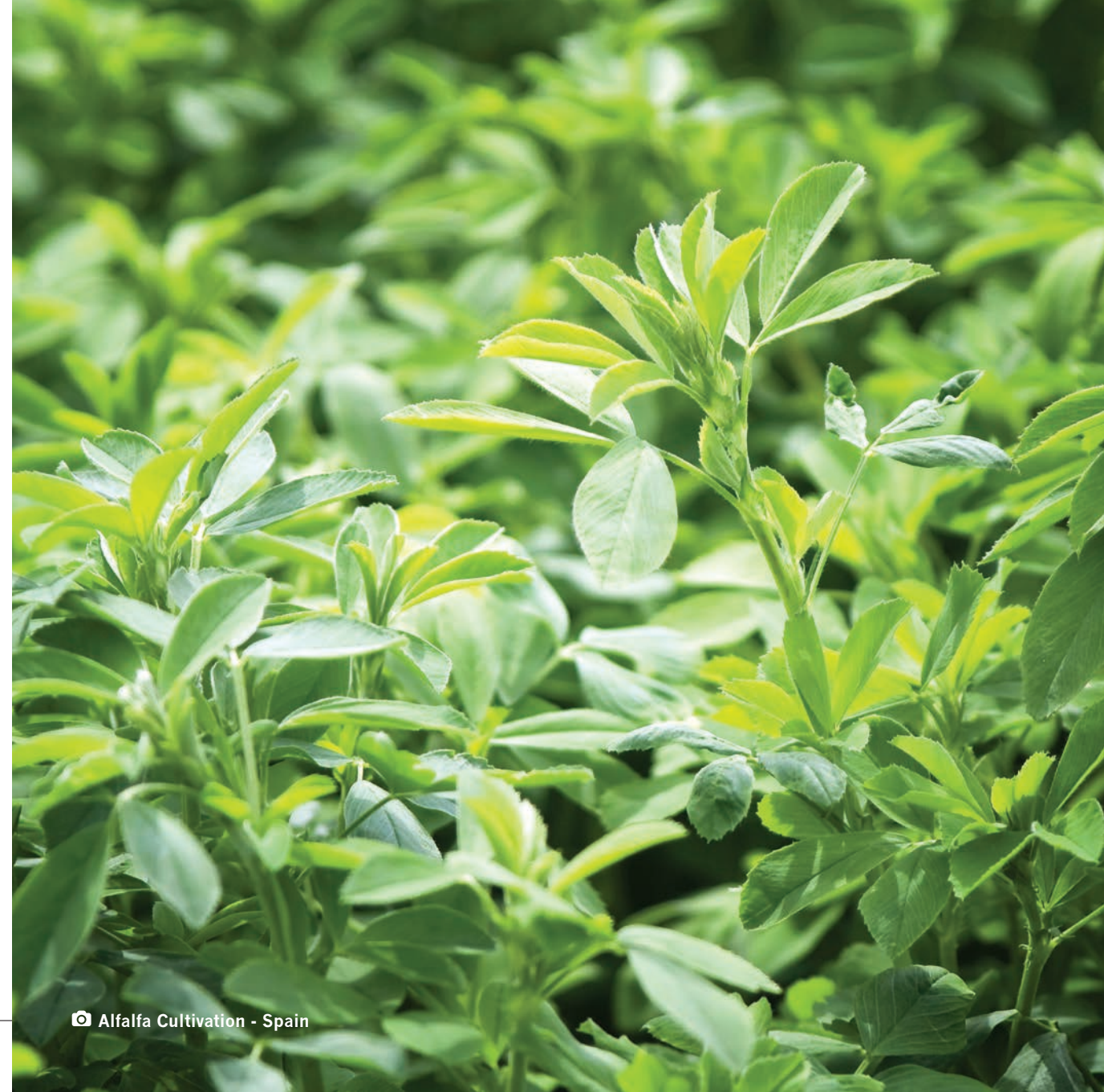
Alfalfa Cultivation - Spain