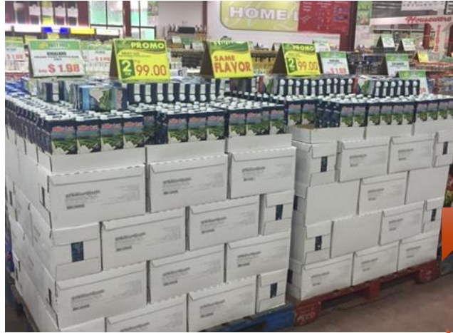
PUREGOLD DUTY FREE - PHILIPPINES