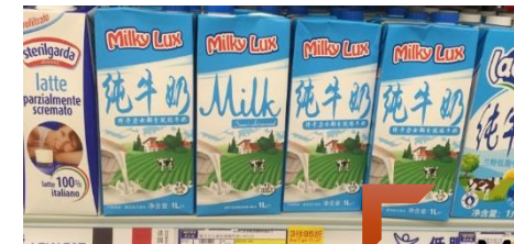
METRO STORES - CHINA