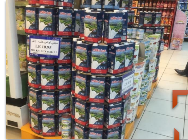
METRO STORES - EGYPT