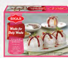
WADA FOR DAHI WADA