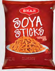
SOYA STICKS TOMATO BITE