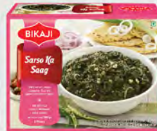
SARSO KA SAAG