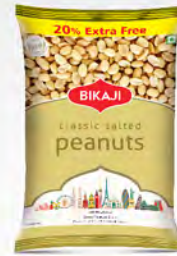
CLASSIC SALTED PEANUTS