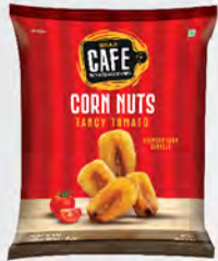
CORN NUTS TANGY TOMATO