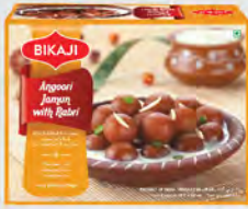
ANGOORI JAMUN WITH RABRI