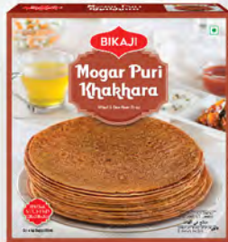
MOGAR PURI KHAKHARA