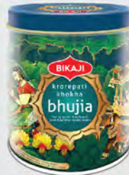
KROREPATI KHOKHA BHUJIA TIN