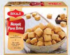
NAMAK PARA BITES