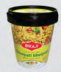
CHOWPATI BHELपुरI (MOBILE BHELपुरI CAN)