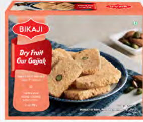
DRY FRUIT GUR GAJJAK