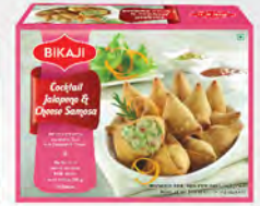
COCKTAIL JALAPENO & CHEESE SAMOSA