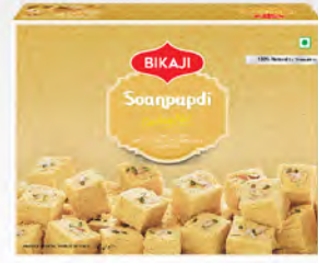
SOANPAPDI (CASHEW NUT)