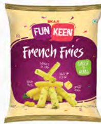
FRENCH FRIES CHEESE-N-HERBS