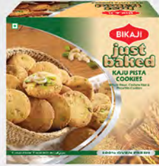
KAJU PISTA COOKIES