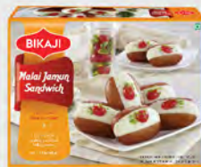
MALAI JAMUN SANDWICH