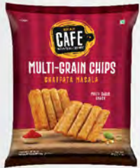
MULTI-GRAIN CHIPS CHATPATA MASALA