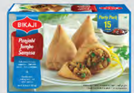
PUNJABI JUMBO SAMOSA