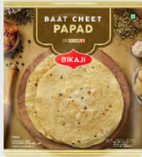
BAAT CHEET PAPAD