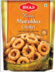
NASHTA MURUKKU CHAKRI