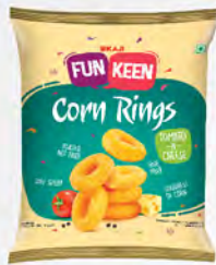
CORN RINGS TOMATO-N-CHEESE