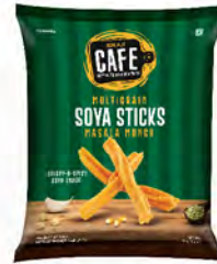
SOYA STICKS MASALA MUNCH