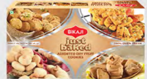
ASSORTED DRY FRUIT COOKIES