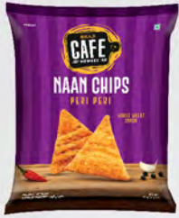
NAAN CHIPS PERI PERI