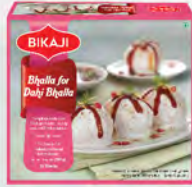
BHALLA FOR DAHI BHALLA