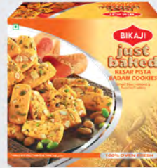
KESAR PISTA BADAM COOKIES