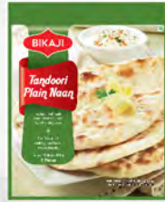
TANDOORI PLAIN NAAN