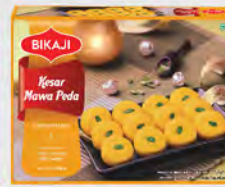
KESAR MAWA PEDAS