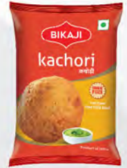
KACHORI (SINGLE PIECE)