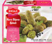
HARA BHARA KEBAB