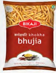
KROREPATI KHOKHA BHUJIA