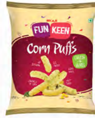
CORN PUFFS CHEESE-N-HERBS