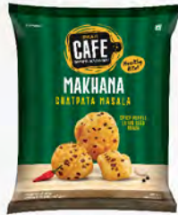
MAKHANA CHATPATA MASALA