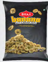
BANANA (SALT & PEPPER CHIPS)