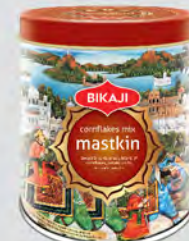
CORNFLAKES MIX MASTKIN TIN