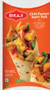
CHILI PANEER KATHI ROLL