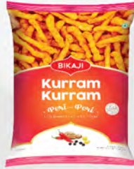
KURRAM KURRAM PERI PERI