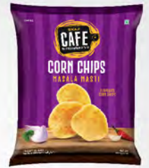
CORN CHIPS MASALA MASTI