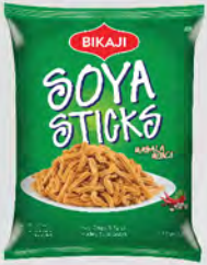
SOYA STICKS MASALA MUNCH