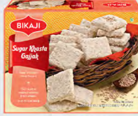
SUGAR KHASHA GAJJAK