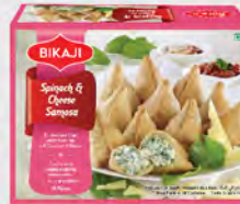
SPINACH & CHEESE SAMOSA