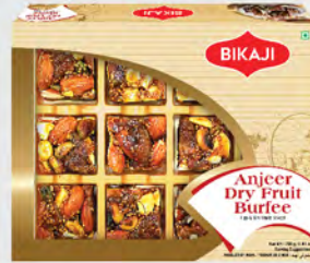
ANJEER DRY FRUIT BURFEE