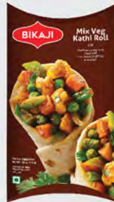
MIX VEG KATHI ROLL