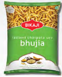
RATLAMI CHATPATA SEV BHUJIA