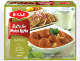
KOFTA FOR MALAI KOFTA