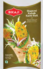
SHAMMI KEBAB KATHI ROLL

Here comes India's famous Kathi Rolls, right from the streets of Kolkata. Choose from six delicious varieties to delight taste buds.