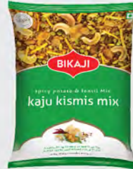
KAJU KISMIS MIX