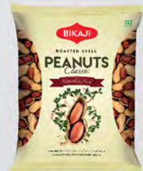
ROASTED SHELL PEANUTS