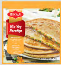
MIX VEG PARATHA