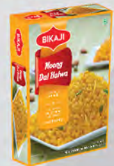
MOONG DAL HALWA