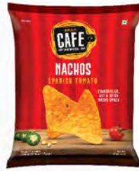
NACHOS SPANISH TOMATO