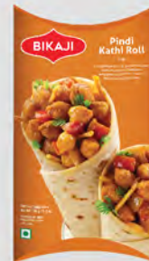
PINDI KATHI ROLL