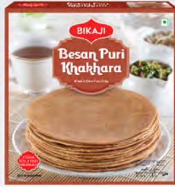
BESAN PURI KHAKHARA