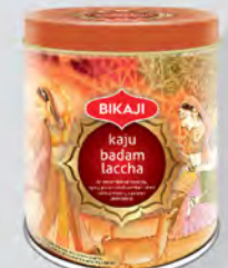
KAJU BADAM LACCHA TIN