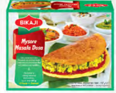
MYSORE MASALA DOSA