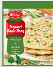
TANDOORI GARLIC NAAN