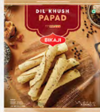
DIL KHUSH PAPAD