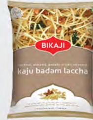
KAJU BADAM LACCHA