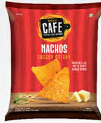
NACHOS CHEESY CRISPY