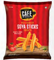
SOYA STICKS TOMATO