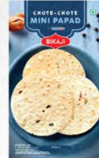
CHOTE - CHOTE MINI PAPAD