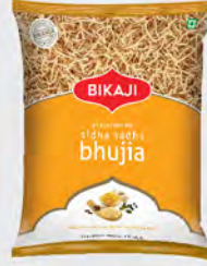
SIDHA SADHA BHUJIA