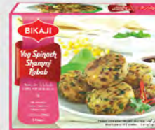
VEG SPINACH SHAMMI KEBAB