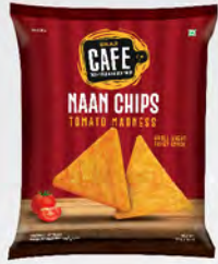
NAAN CHIPS TOMATO MADNESS