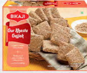
GUR KHASHA GAJJAK