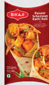
PANEER SCHEZWAN KATHI ROLL