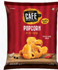
POPCORN PERI PERI