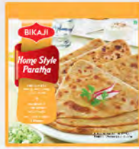
HOME STYLE PARATHA