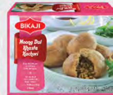
MOONG DAL KHASTA KACHORI