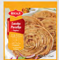
LACCHA PARATHA TANDOOR