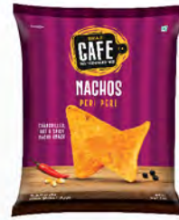
NACHOS PERI PERI