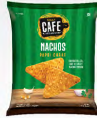
NACHOS PAPDI CHAAT