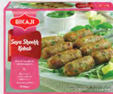
SOYA SHEEKH KEBAB