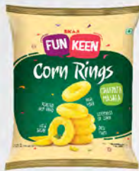
CORN RINGS CHATPATA MASALA