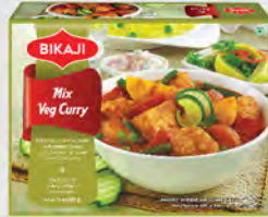
MIX VEG CURRY