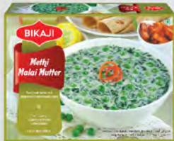
METHI MALAI MUTTER