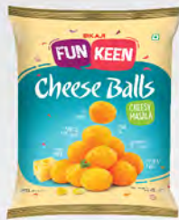
CHEESE BALLS CHEESY MASALA