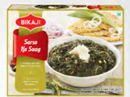
SARSO KA SAAG