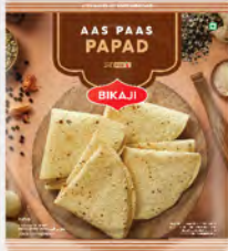
AAS PAAS PAPAD