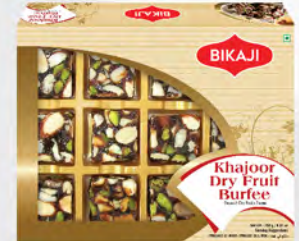
KHAJOOR DRY FRUIT BURFEE