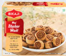
MINI BHAKAR WADI