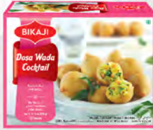
DOSA WADA COCKTAIL