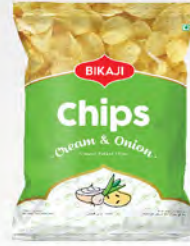
CREAM & ONION