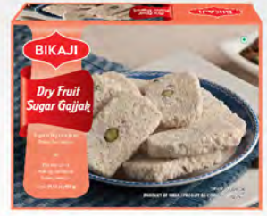
DRY FRUIT SUGAR GAJJAK