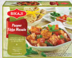
PANEER TIKKA MASALA