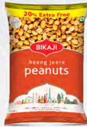
HEENG JEERA PEANUTS