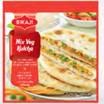
MIX VEG KULCHA