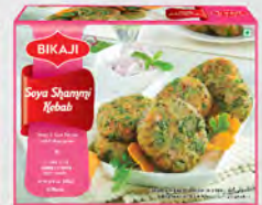
SOYA SHAMMI KEBAB