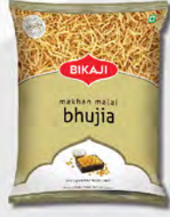
MAKHAN MALAI BHUJIA