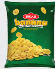
BANANA (SALTED YELLOW CHIPS)