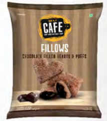
FILLOWS CHOCOLATE FILLED HEARTS & PUFFS