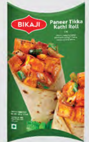
PANEER TIKKA KATHI ROLL