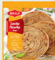
LACCHA PARATHA TAWA