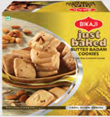
BUTTER BADAM COOKIES