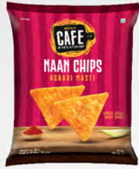
NAAN CHIPS ACHARI MASTI