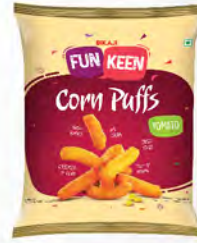
CORN PUFFS TOMATO