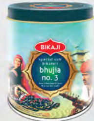
SPECIAL SOFT BIKANERI BHUJIA NO.3 TIN