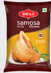
MINI SAMOSA (SINGLE PIECE)