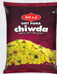
DIET POHA CHIWDA