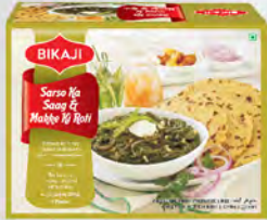
SARSO KA SAAG & MAKKE KI ROTI