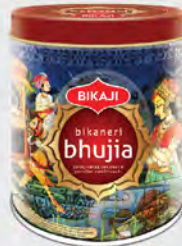
BIKANERI BHUJIA TIN