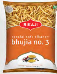
SPECIAL SOFT BIKANERI BHUJIA NO.3