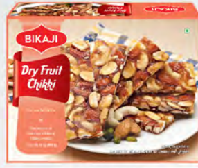
DRY FRUIT CHIKKI