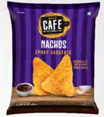
NACHOS SMOKY BARBEQUE