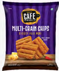
MULTI-GRAIN CHIPS CHEESY PERI PERI