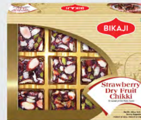
STRAWBERRY DRY FRUIT CHIKKI