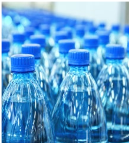
Water dispensers are permitted.