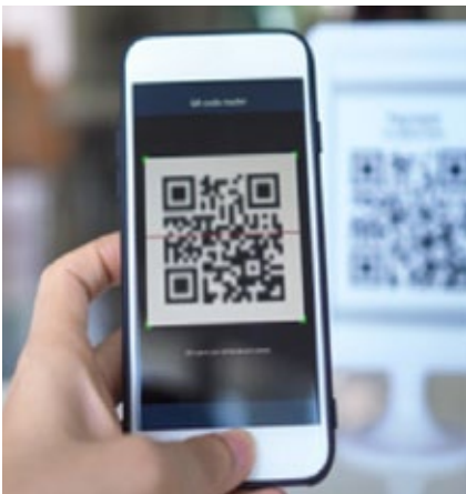
We encourage the use of digital promotional materials throughout the event via QR codes.