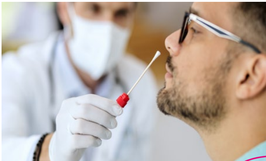
PCR Testing Clinic available onsite.