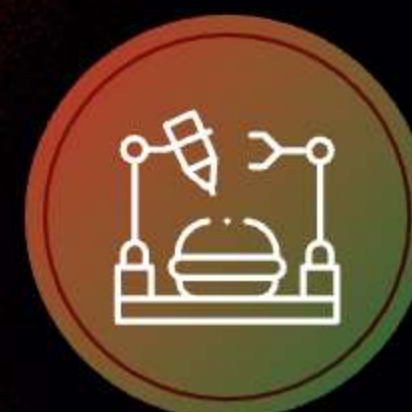
F&B Startups, Investors, Venture Capitalists, Consultancies & Entrepreneurs