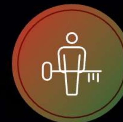
Distributors & Resellers