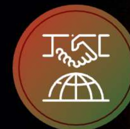
Government & Trade Organisations