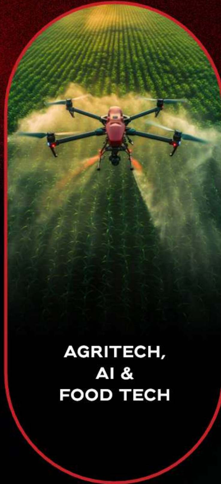
AGRITECH, AI & FOOD TECH