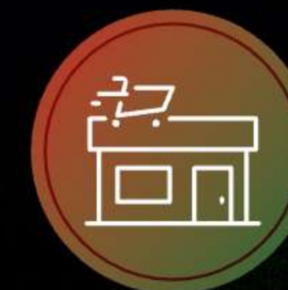
Retailers, Supermarkets & Hypermarkets