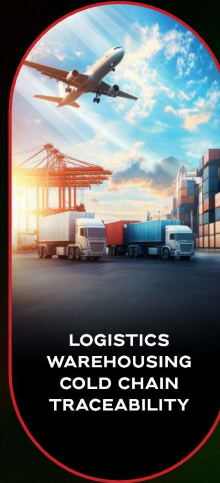
LOGISTICS WAREHOUSING COLD CHAIN TRACEABILITY