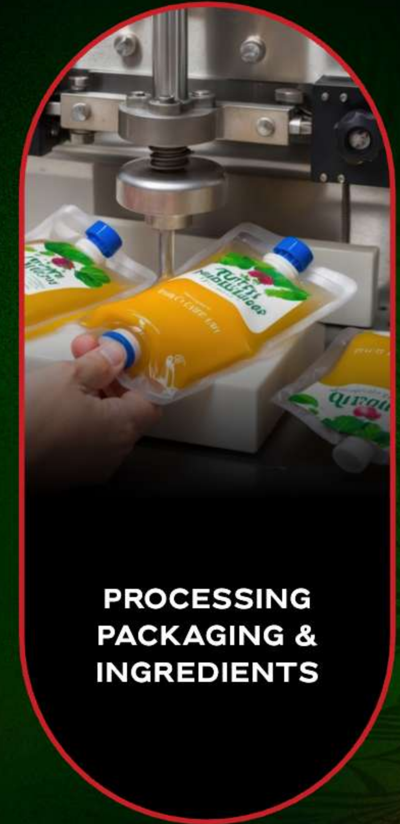
PROCESSING PACKAGING & INGREDIENTS