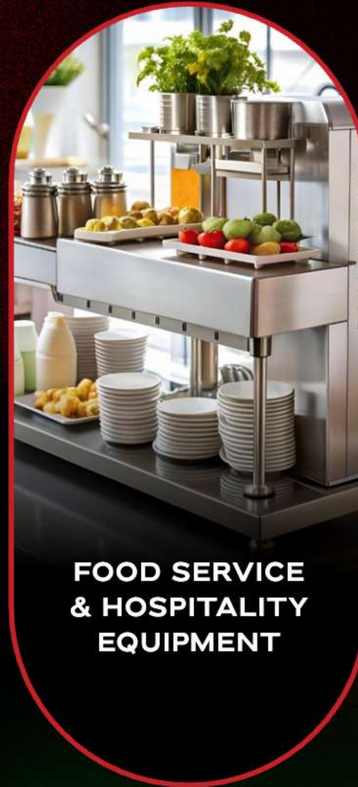
FOOD SERVICE & HOSPITALITY EQUIPMENT