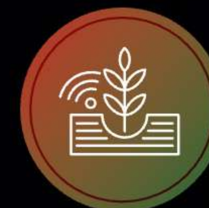
Agricultural Professionals & Enterprises