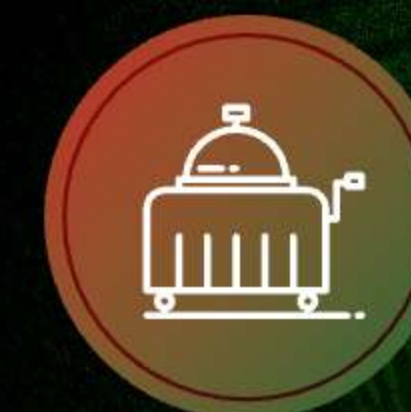
Hotels, Restaurants, Hospitality & Catering Companies