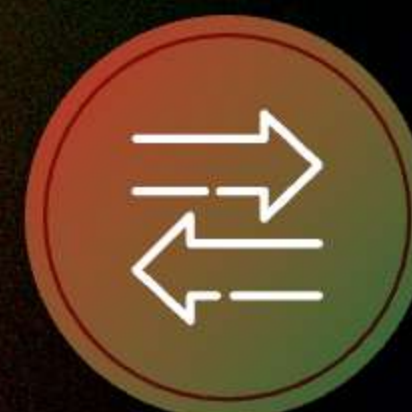
Importers & Exporters