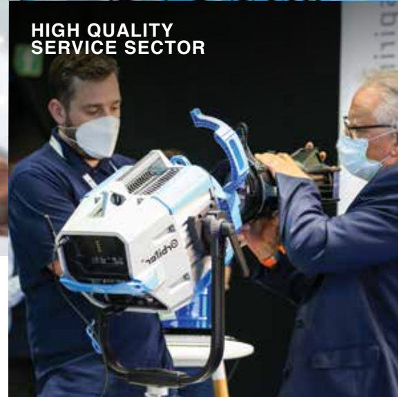
HIGH QUALITY SERVICE SECTOR