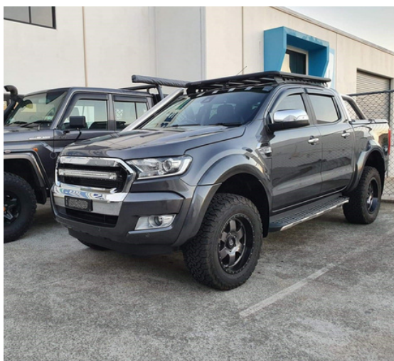
Ford Ranger/Mazda BT50