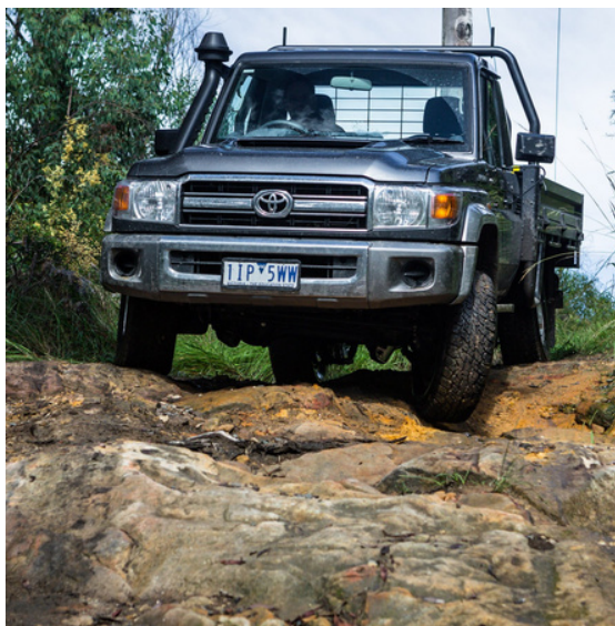
Toyota 70 Landcruiser