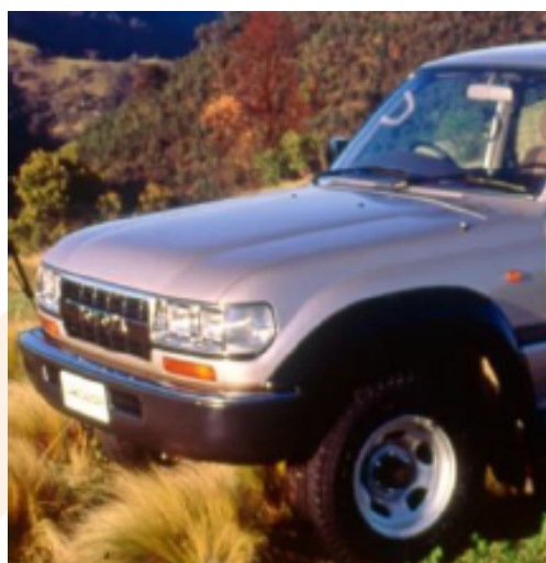
Toyota 80/105 Landcruiser