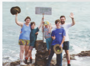
WALDRON FAMILY - CAPE YORK