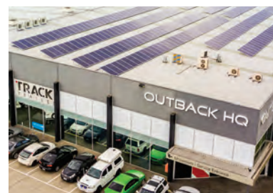
TRACK FACTORY AND MELBOURNE OUTLET OUTBACK HQ

From humble beginnings we have climbed to heights none of us could have imagined. We have endured and 'made hay' on the economic swings and roundabouts and continuously innovated, inspiring our customers and competitors alike.