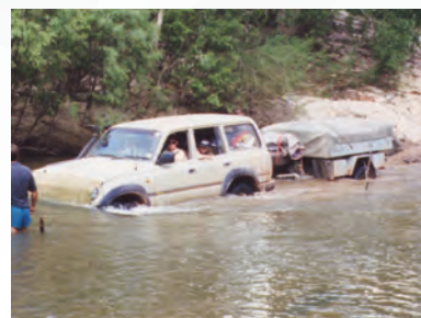
TRACK TRAILER EAGLE CAMPER