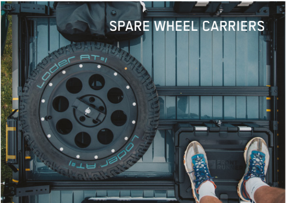
SPARE WHEEL CARRIERS