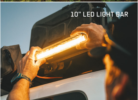
10" LED LIGHT BAR