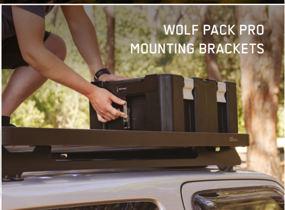
WOLF PACK PRO MOUNTING BRACKETS