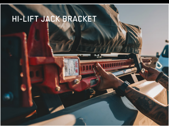
HI-LIFT JACK BRACKET