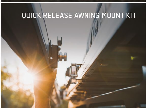
QUICK RELEASE AWNING MOUNT KIT