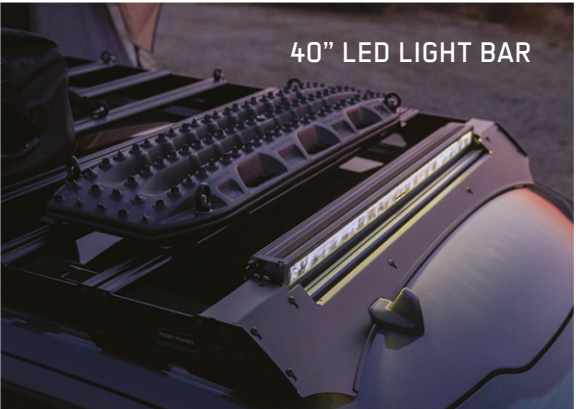
40" LED LIGHT BAR