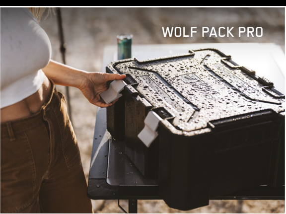
WOLF PACK PRO