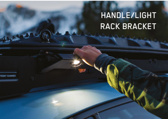
HANDLE/LIGHT RACK BRACKET