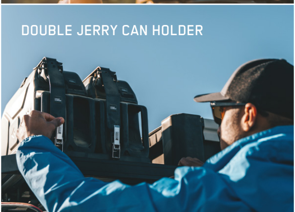
DOUBLE JERRY CAN HOLDER