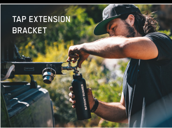
TAP EXTENSION BRACKET