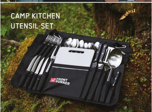
CAMP KITCHEN UTENSIL SET