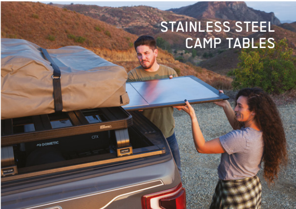
STAINLESS STEEL CAMP TABLES