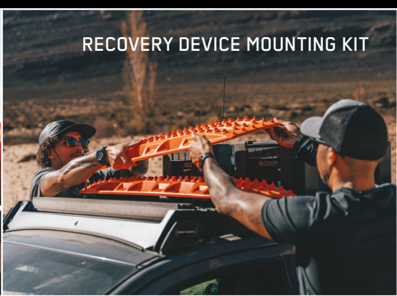
RECOVERY DEVICE MOUNTING KIT