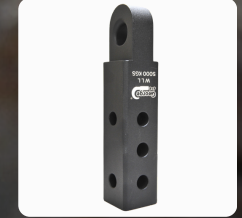
Matte Black SK 232mm