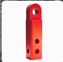
Red Alloy Standard 200mm