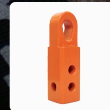
Orange SK+ 170mm