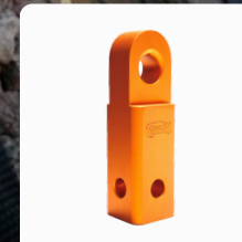
Orange SK 170mm