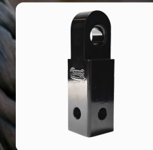
Glass Black SK 170mm