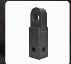
Matte Black SK 170mm