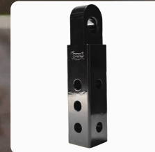
Glass Black SK 232mm