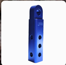
Blue Alloy Standard 230mm