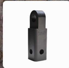
Black Steel Standard 160mm