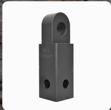
Black Alloy Standard 160mm