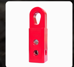
Red SK+ 170mm