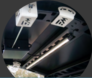
Lighting & central locking