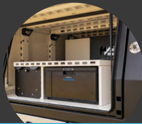
Inbuilt drawer fridges/ Upright fridges