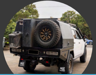
Multiple rear wall configurations