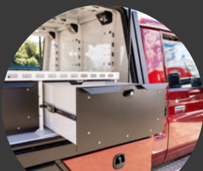
Drawer storage options