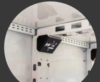
Industry leading bracing