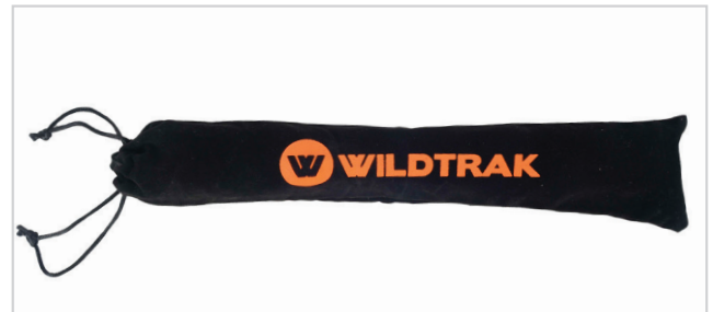
PROTECTIVE STORAGE BAG