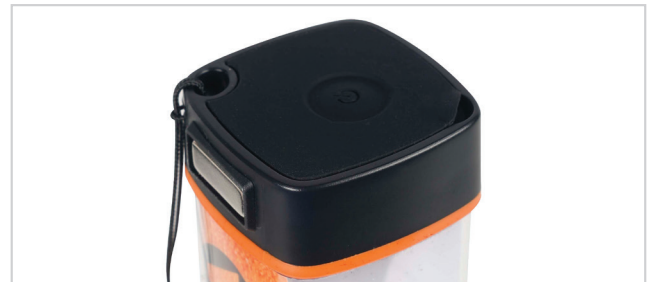
MAGNET ON EACH END FOR EASY MOUNTING AND HANDY LANYARD FOR HANGING OPTION