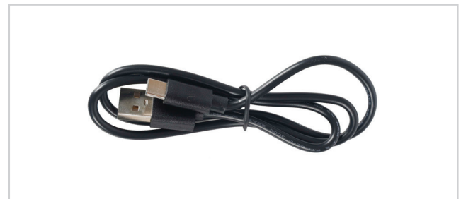
USB-C CHARGING CABLE