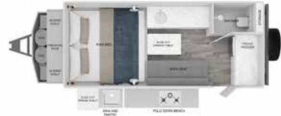
NIRVANA 16B POPTOP ATM: 3500Kg | TARE 2500Kg* LENGTH: 7.22m | HEIGHT: 2.6m