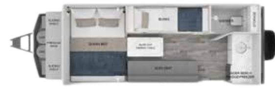
NIRVANA 16 FAMILY POPTOP or HARDTOP ATM: 3500Kg | TARE 2500Kg* | LENGTH: 7.22m HEIGHT: 2.6m Poptop / 3.12m Hardtop 3 bunk option only available in the Hardtop model.