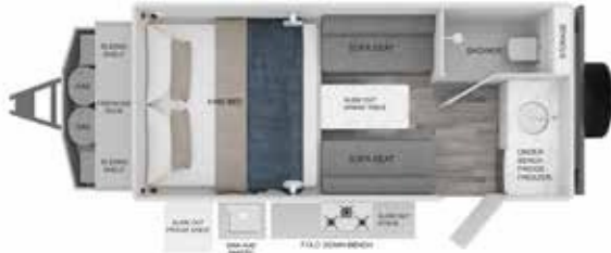
NIRVANA 14 POPTOP ATM: 2900Kg | TARE 2150Kg* LENGTH: 6.59m | HEIGHT: 2.6m