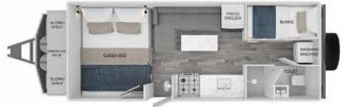
ELYSIUM 19'6 FAMILY ATM: 3500Kg | TARE 2780Kg* LENGTH: 8.13m | HEIGHT: 3.12m