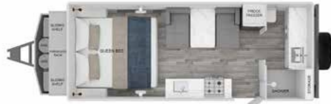
ELYSIUM 19'6 ATM: 3500Kg | TARE 2780Kg* LENGTH: 8.13m | HEIGHT: 3.12m