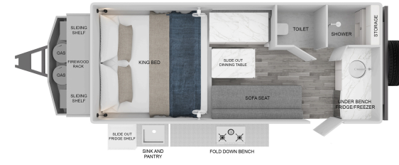
NIRVANA 16C POPTOP or HARDTOP ATM: 3500Kg | TARE 2500Kg* | LENGTH: 7.22m HEIGHT: 2.6m Poptop / 3.12m Hardtop