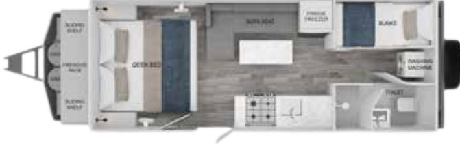
ELYSIUM 21'6 FAMILY ATM: 3500Kg | TARE 2930Kg* LENGTH: 8.80m | HEIGHT: 3.12m