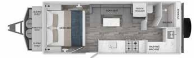
ELYSIUM 21'6 ATM: 3500Kg | TARE 2930Kg* LENGTH: 8.80m | HEIGHT: 3.12m