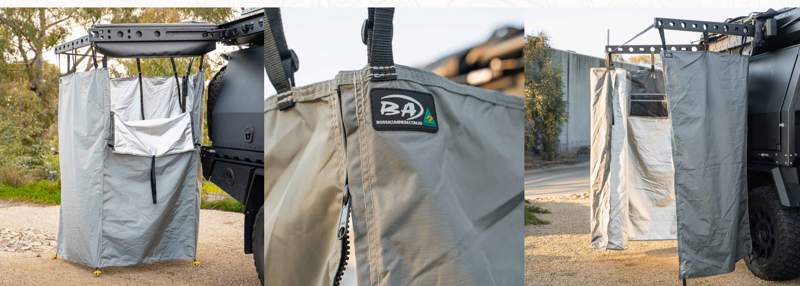
Rear Access Flap