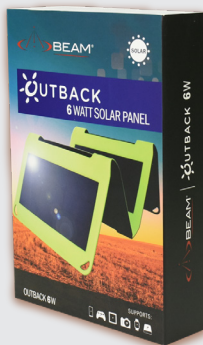
BEAM OUTBACK 6 WATT SOLAR PANEL