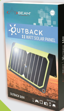
BEAM OUTBACK 11 WATT SOLAR PANEL