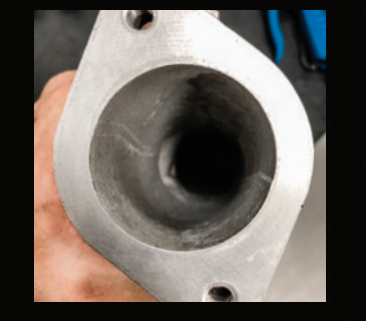
Catch can kit installation = Clean inlet manifold

Simple in design and strong in construction live now