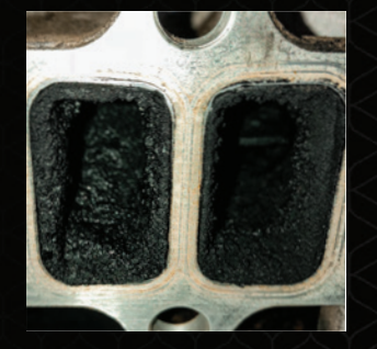
Contaminated inlet manifolds