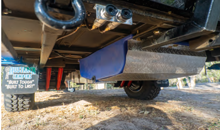
Water storage: 2 x 120L Foodgrade poly water tanks 12.5L per min 12V Electric Pump Water tank guards, water gauge