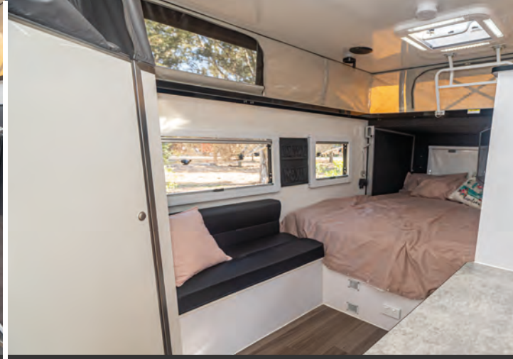
Adjustable and removable dining table, faux leather sofa.