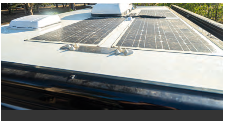
4 x 100W roof mounted solar panels.

REDARC Manager30 complete battery management & charging system