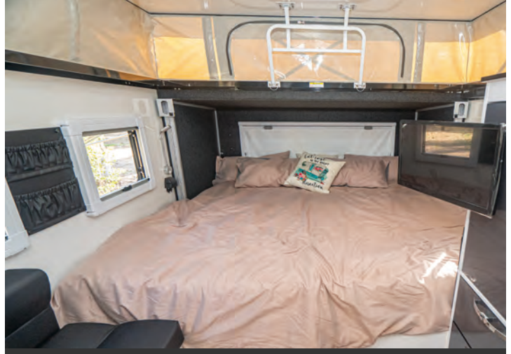
King size innerspring mattress.