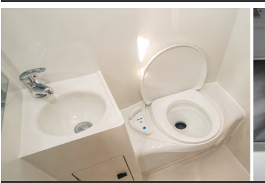
Truma Water ultra rapid Gas/electric water heater. Full internal bathroom with electric flushing toilet (external removable cassette), vanity sink with mirror and fully adjustable shower rose and shower curtain. External hot/cold RV Side Mounted Shower Tent.