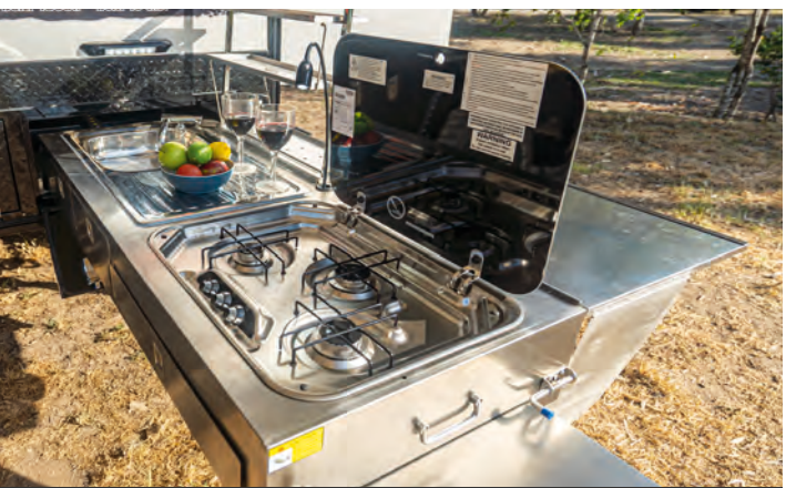
Slide out stainless steel kitchen with cutlery drawer, utility drawers electric pump, hot/cold tap, large sink and AGA approved multi burner stove with wind break.