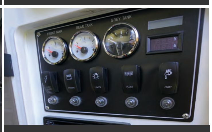
Control panel with water level gauges, multimedia system.