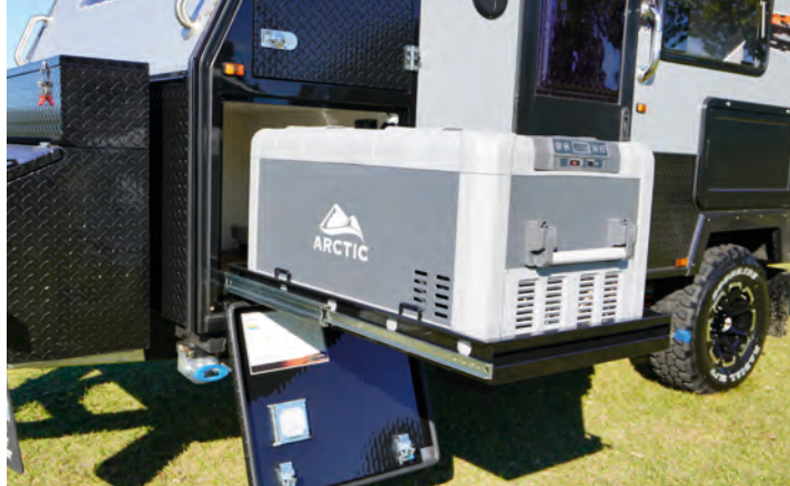
Fridge: Fridge slide, 980 (L) x 530 (W) x 525 (H) mm with tie down points. Optional Arctic fridge available.