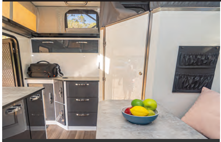
Living space with generous storage.