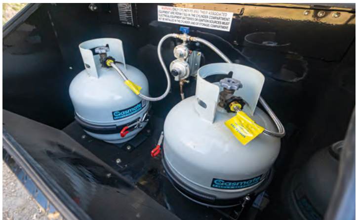
Completely plumbed from gas bottles to kitchen with dual bottle change over valve and gas certification certificate. Additional bayonet gas connection at rear of camper for a BBQ gas supply.