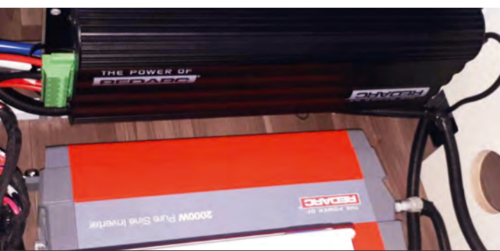
REDARC 2kW Pure Sinewave inverter with remote switch

REDARC Manager30 complete battery management & charging system