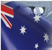
AUSTRALIAN DESIGNED AND ADR CERTIFIED