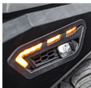
FULL LED TURN SIGNALS AND DAYTIME RUNNING LIGHTS AND FOG LAMPS