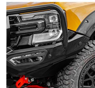
MINIMUM PROTRUSION FROM FRONT GRILL