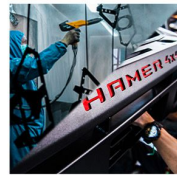
POWDER COATED MATTE BLACK FINISH (FROM FACTORY) COLOR-CODED FINISH (AVAILABLE LOCALLY)