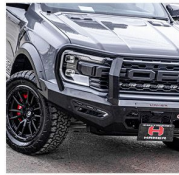
FULL BUMPER REPLACEMENT, SLEEK & INTEGRATED TO THE VEHICLE. LIGHTWEIGHT DESIGN.