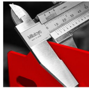
3MM HIGH-GRADE STEEL PLATE