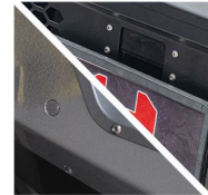
SUPPORT ORIGINAL FACTORY SENSORS & RADAR MODULE COMPATIBLE