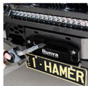
WINCH COMPATIBLE (UP TO 12,000LBS)