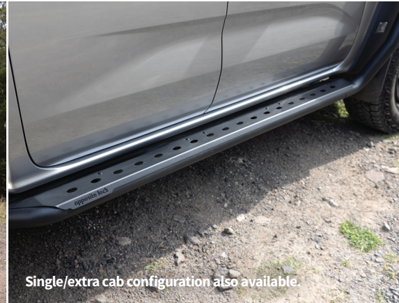
Single/extra cab configuration also available.

The Opposite Lock Bull Bar has evolved to travel every journey from day-to-day driving to tackling some of the most extreme adventures. Made from high-grade steel to offer outstanding protection, functionality, and good looks.