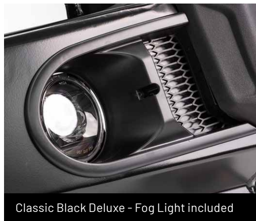
Classic Black Deluxe - Fog Light included