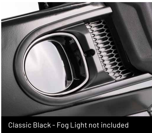
Classic Black - Fog Light not included