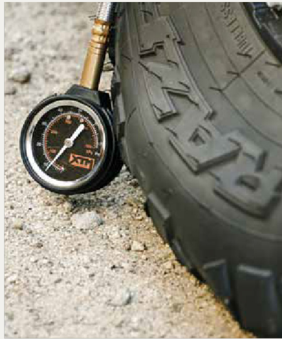
Follow us to see more!

Instagram: avanterra_group/secondair.beadlocks