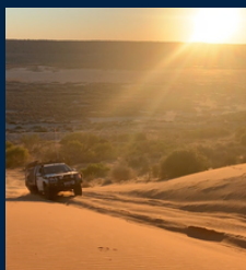
Simpson Desert and surrounds