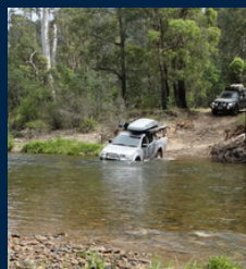
Victorian High Country