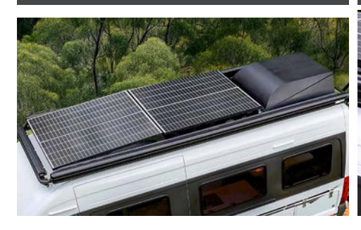
AEROPOD STORAGE BOX