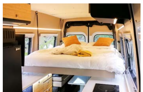
POWERGLIDE LOFT BED