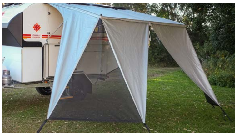
Kwik Awning with Bedouin Extension