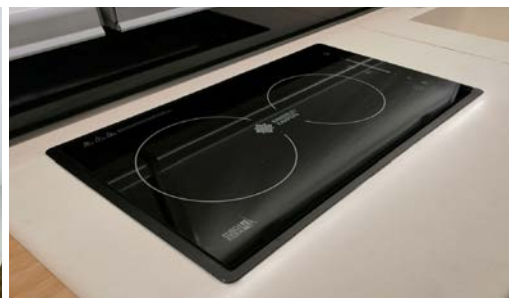
Cook inside - optional dual induction cooktop (model varies by country)