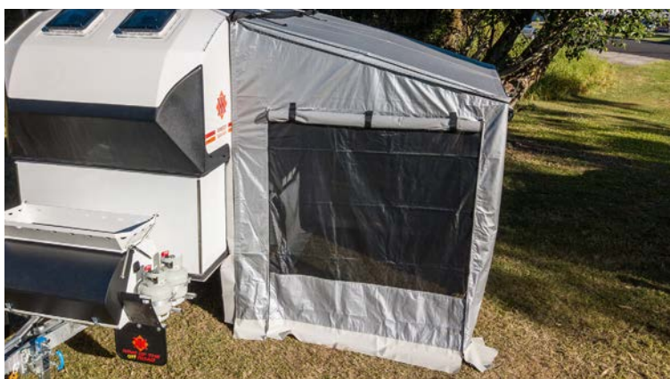
Full set of walls fully encloses awning area