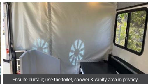
Ensuite curtain; use the toilet, shower & vanity area in privacy.