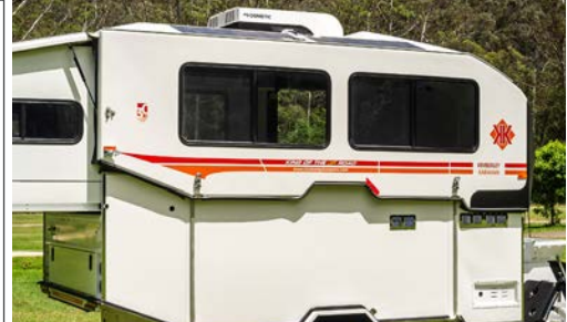
Larger driver side windows