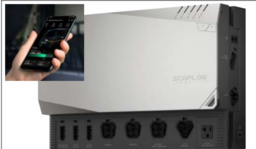
SMART 48V Power Hub with Control Panel APP