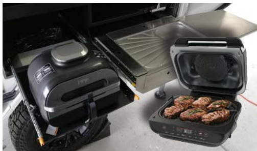
E-Galley Kitchen - large sink & Electric Ninja® Foodi™ Smart XL Grill BBQ