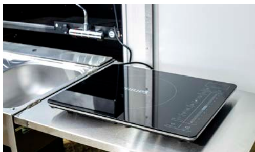
Cook outside - optional single induction cooktop (model varies by country)