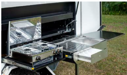
Standard outside kitchen with hot & cold water, large sink, large prep bench & 2 Burner stove with Griller