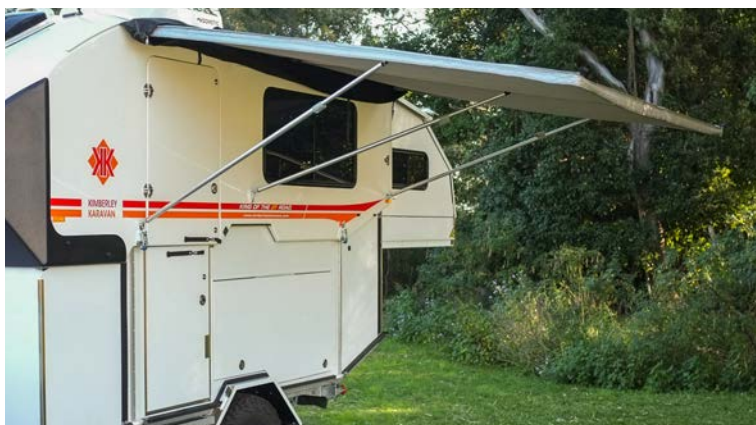
Kwik Awning - add vertical poles for wind