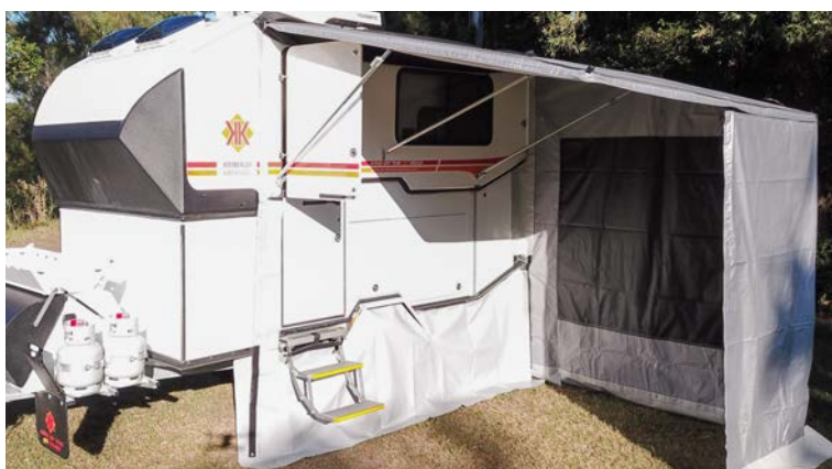
Kwik Awning + Rear L Wall