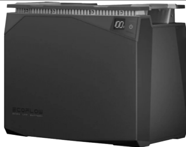
5000Wh SMART 48V Battery