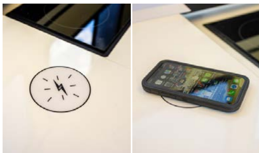
Underbench wireless charging for smart phones and tablets.