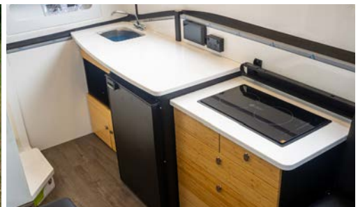
- Galley kitchen with sink on left, induction cooktop on right.