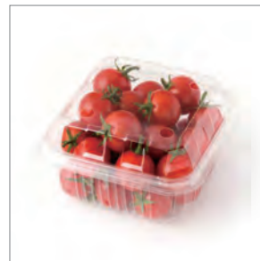
Food Grade Packages