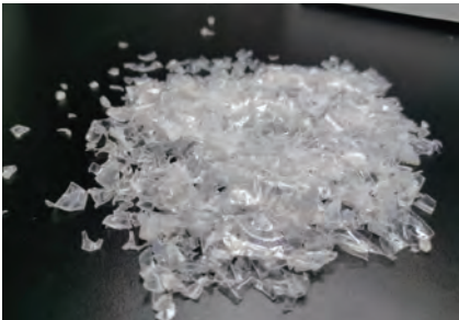
r-PET Clear Flakes-White