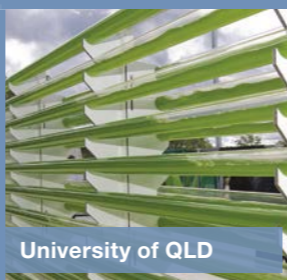
University of QLD