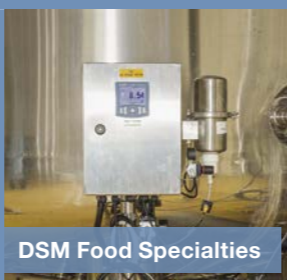
DSM Food Specialties