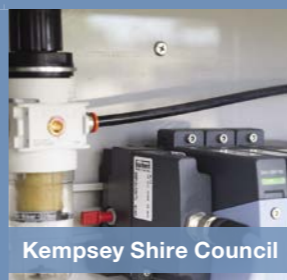
Kempsey Shire Council