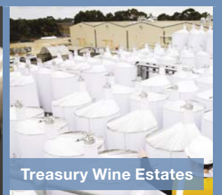
Treasury Wine Estates