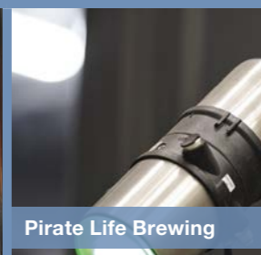
Pirate Life Brewing