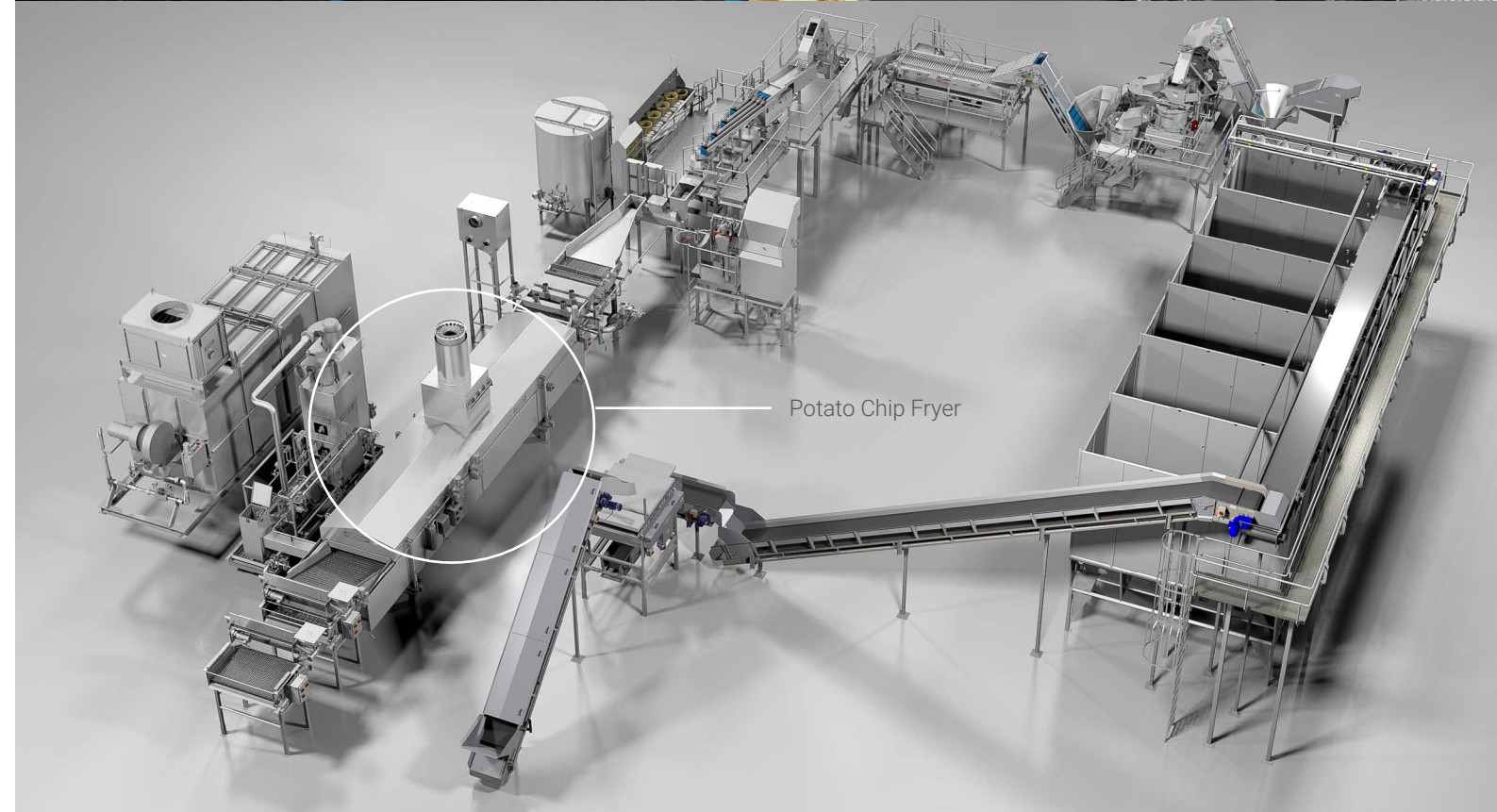
Potato Chip Fryer

We've been working to make food look and taste good since 1950 and even though the fashion and flavours have changed, our commitment to provide the industry with the most efficient solutions without compromising taste is the same.