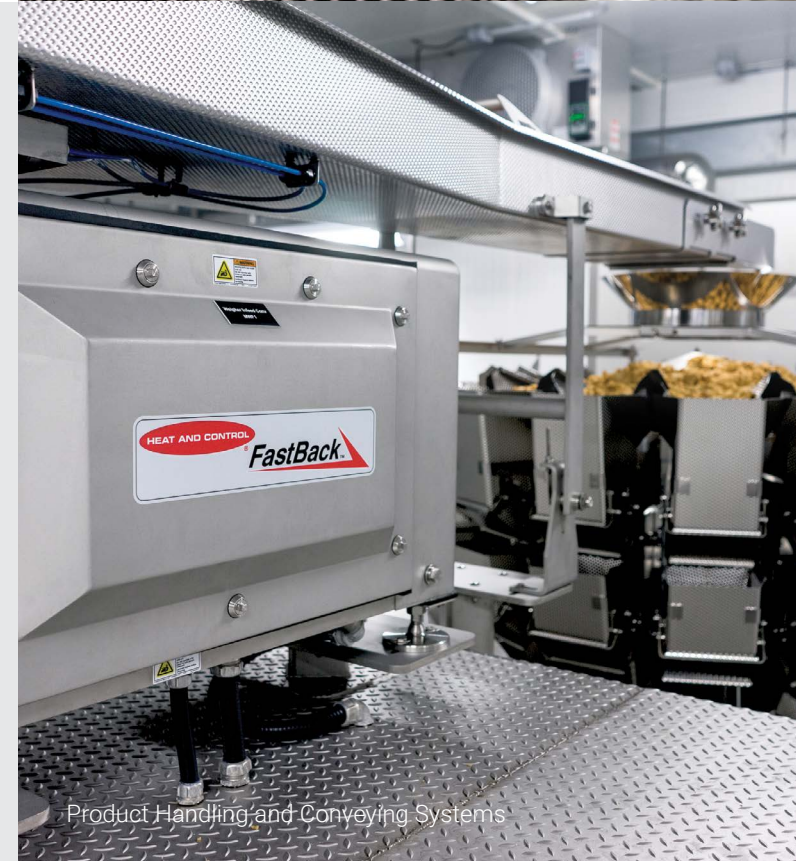
Product Handling and Conveying Systems