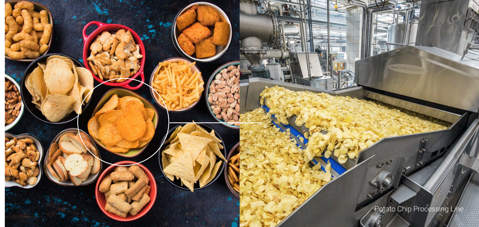
Potato Chip Processing Line