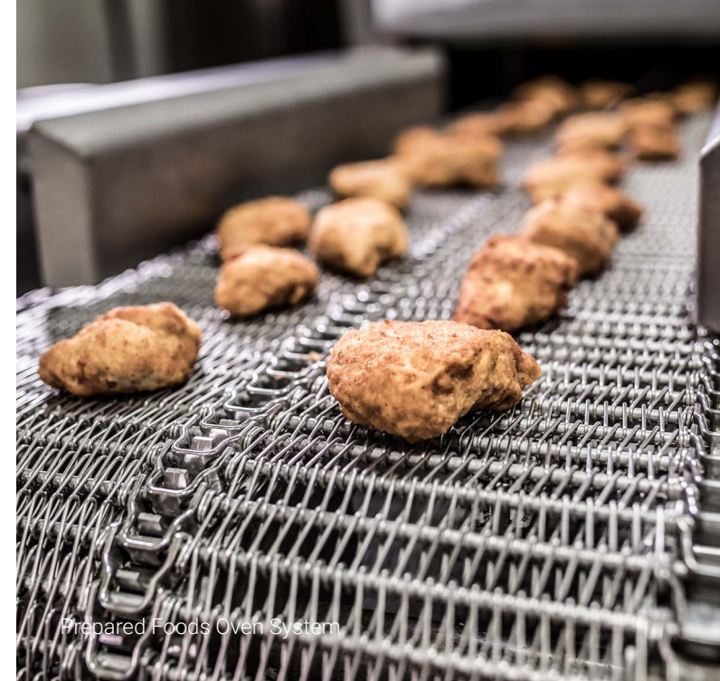
Prepared Foods Oven System