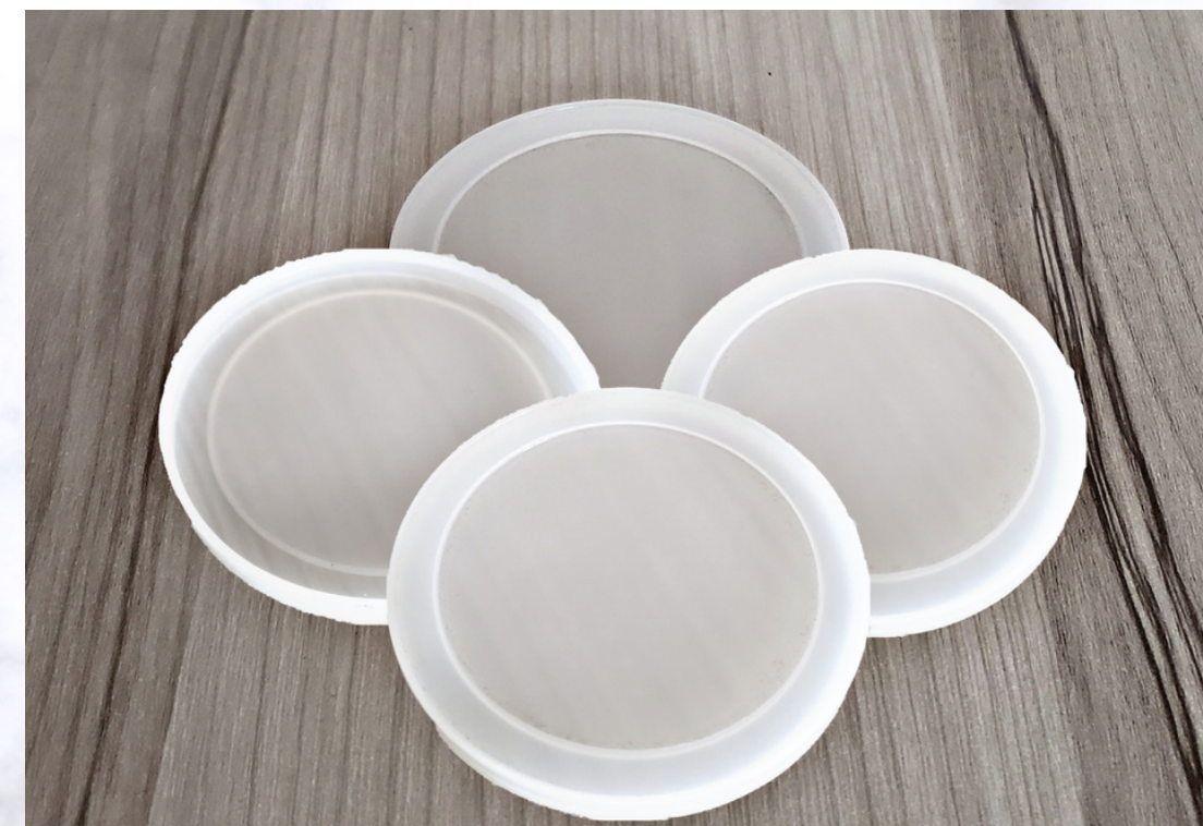
Plastic cover caps for food can